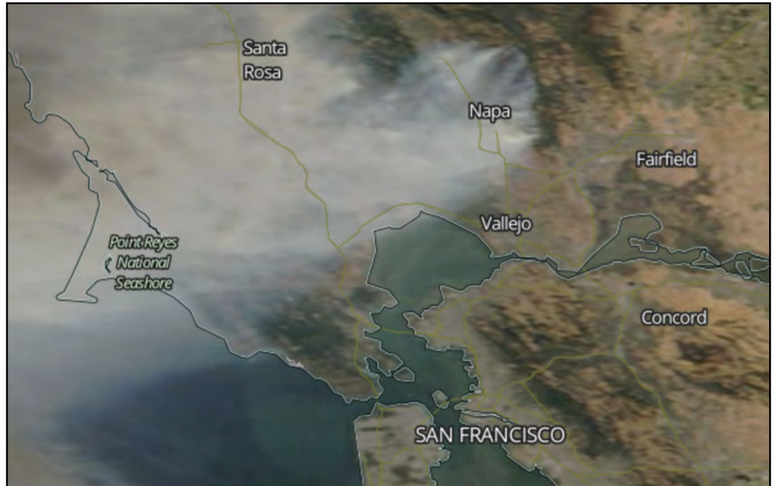
A photo from NASA's Terra satellite taken on Oct. 9, 2017, showing plumes of smoke from the Tubbs Fire.