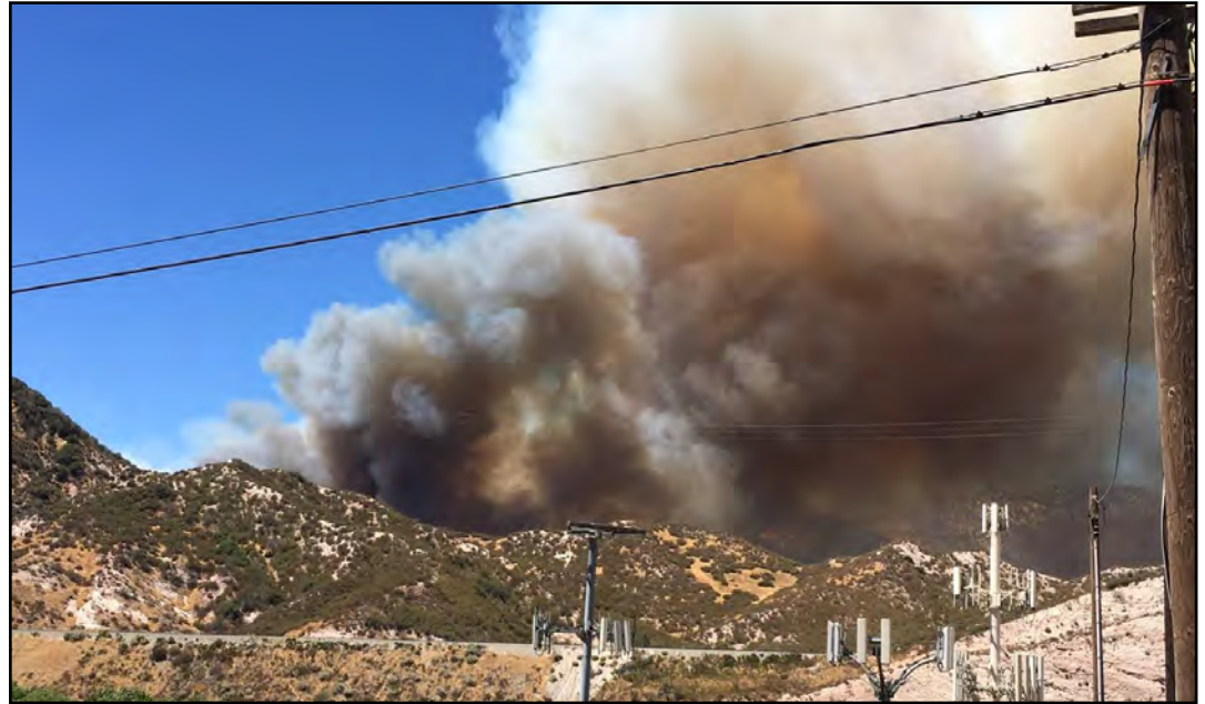
The Blue Cut Fire of August 2016, as photographed by the San Bernardino County Fire Department.

While there were multiple fires throughout SCE's service territory in 2016, SCE is only seeking to recover the incremental costs it incurred as a result of the Blue Cut, Erskine, and Sand Fires in San Bernardino, Kern, and Los Angeles counties, respectively. These costs include: restoring service to