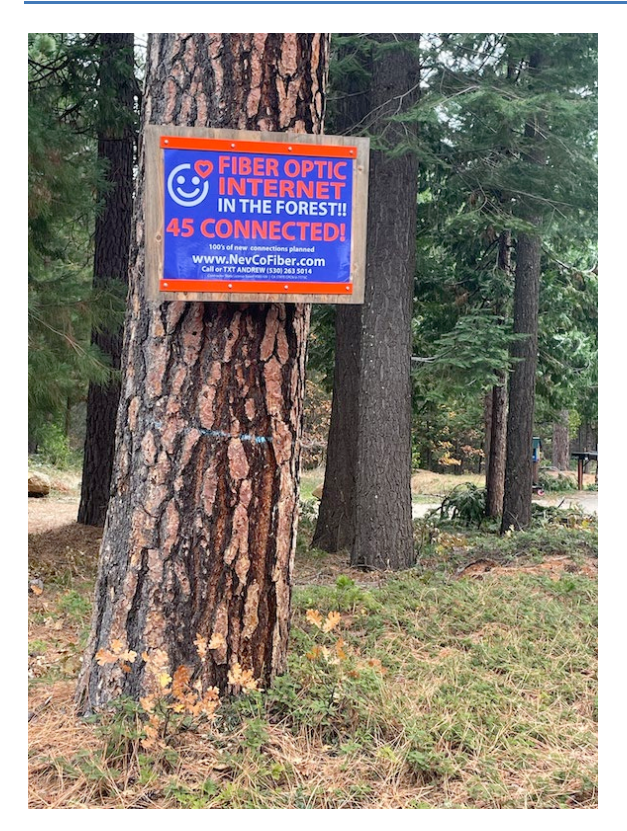
Figure 1: NevCo Fiber optic notice in the forest.

The table on the following page provides broadband adoption levels for each county using FCC deployment data as of June 30, 2023, and CPUC subscriber data as of December 31, 2022. This year's CASF Annual Report relies on CPUC subscriber data because the FCC does not make subscriber data publicly available. The CPUC collects data from broadband providers pursuant to an annual data request the Communications Division sends to known providers of broadband service in California. Subscription data collected from providers at the address level is aggregated to the county level for the purposes of displaying adoption of broadband service in the below table. Providers report adoption levels as part of their submission as consumer connections<sup>22</sup>, instead of households.