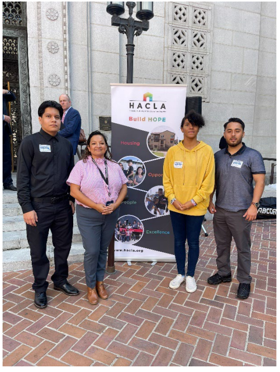
Figure 7: Smart City Showcase

The CPUC implemented the programmatic changes to the Public Housing Account resulting from SB 156 in D.22-05-029 such as changes for publicly supported housing developments including farmworker housing and allocated $15 million funding for FY 2022-23. Projects funded after 2022 are subject to the rules and guidelines adopted in D.22-05-029. For FY 2023-2024, the CPUC issued Resolution T-17782 which allocated $15 million for the Public Housing Account.