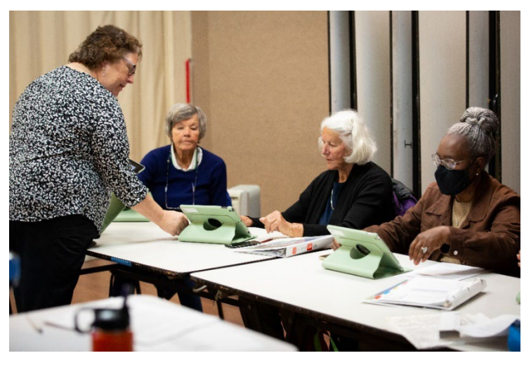
Figure 5: Digital literacy training at Vivalon Talking Tech in San Rafael