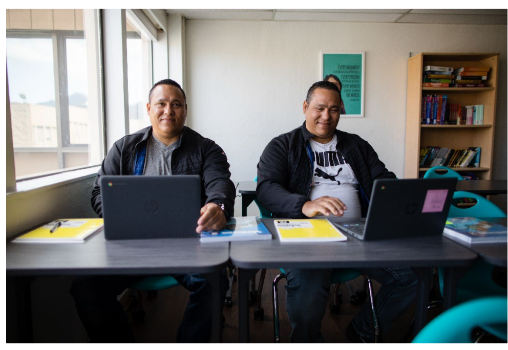
Figure 4: Canal Alliance students participating in digital literacy class.

The CPUC issued D.22-05-029, which allocated $20.024 million for FY 2022-2023 for the Adoption Account. For FY 2023-2024, the CPUC issued Resolution T-17782, which allocated $20.24 million for the Adoption Account.