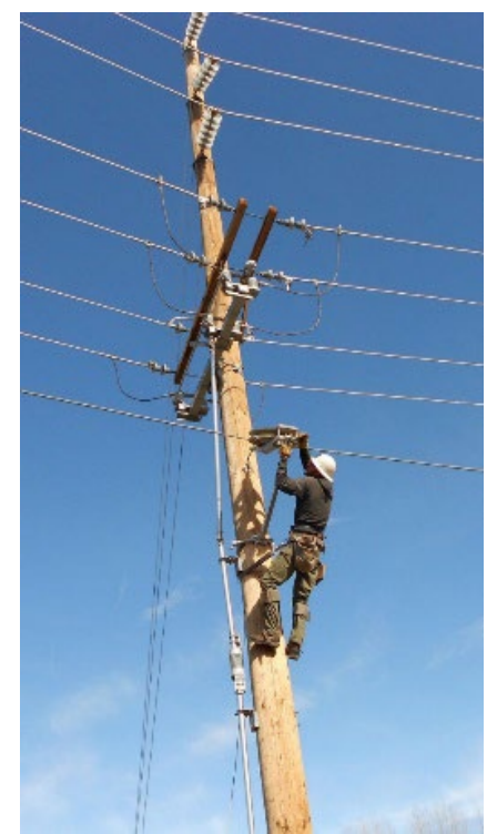
Figure 3: Hunter Communications placing fiber in Humboldt County for the Hoopa Valley Broadband Initiative Completed in July 2023 and currently active with 220 subscribers.

The CPUC is required to report the cost per household for each infrastructure project.<sup>28</sup> Attachment A provides the cost per household each project as of December 31, 2023. The table below shows the average cost per household for all approved last-mile, middle-mile, and hybrid projects. The cost per household is calculated by dividing the total amount awarded by the total estimated potential households in the project. However, this amount does not reflect the full cost of connecting a household as the CASF awards did not subsidize 100 percent of project costs prior to the passage of AB 1665 in 2017.