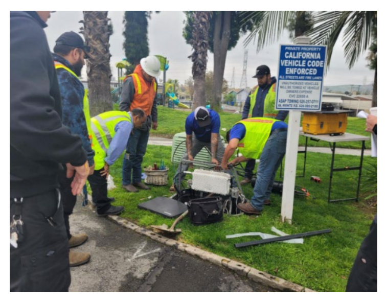
Figure 2: Charter Communications constructing last-mile fiber splices for the Brookside Mobile Home Park in Los Angeles County. Completed in 2023 and now has 190 broadband subscribers.

The CPUC made approximately $13.8 million in payments in 2023 for 15 approved infrastructure projects. The following table lists the payments made for specific projects. The expected benefits of funds expended in 2023 can be expressed as the number of households that will have access to broadband. An estimated 13,025 potential households will have access to broadband from the payments to projects that are listed in the following table. The grantees for projects approved after November 2022 will waive installation fees and provide service at the fixed monthly subscription rate (per the application) for a minimum of five years.<sup>23</sup>