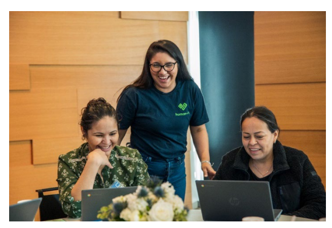
Figure 6: human-i-t digital literacy training.

Digital Literacy: 37,588 people completed eight hours or more of digital literacy training and 17,467 new broadband subscriptions from the 337 in progress or completed projects awarded as of December 31, 2023.