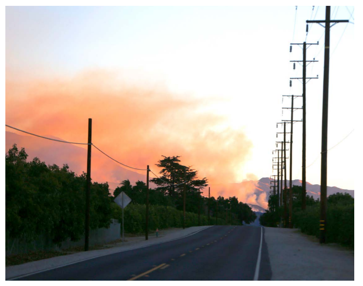
Smoke rises from the Thomas Fire in 2017, approaching power lines and electric infrastructure

"When we are fortunate enough to have forewarning of high-fire