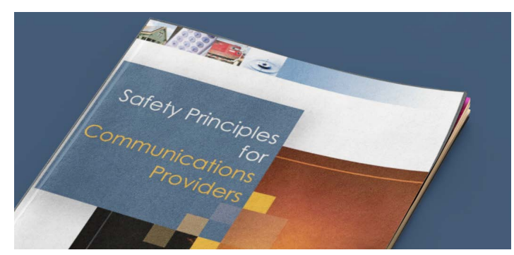
The CPUC's April 2019 staff-produced paper "Safety Principles for Communications Providers"

optic, wireless, and satellite infrastructure."