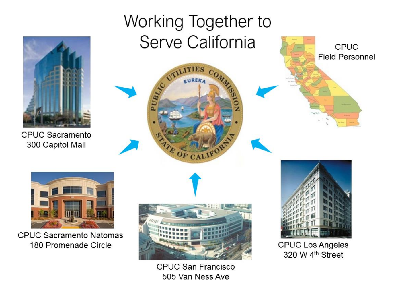
Figure 1: CPUC Staff Locations Throughout California

Working Together – OSA collaborated with CPUC staff and stakeholders in many locations during 2018.