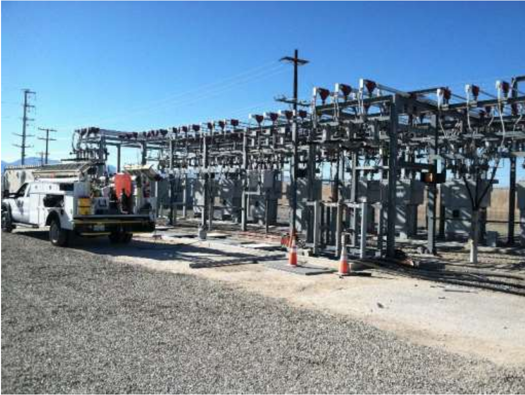
Figure 1 – Crews continued upgrading components of the old Downs Substation during the subject period. View northwest, 03/22/16.