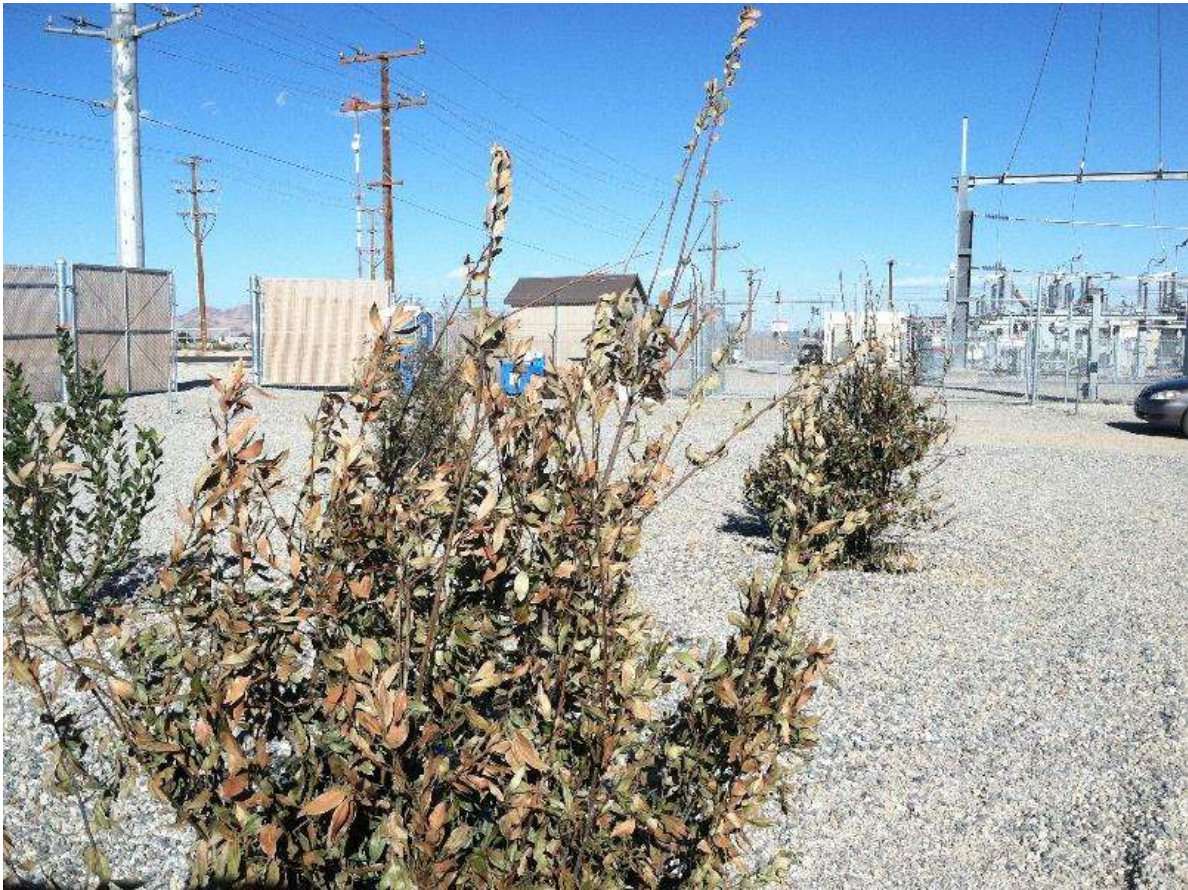
Figure 4 – Landscaping vegetation is showing signs of stress. View northeast, 03/22/16.