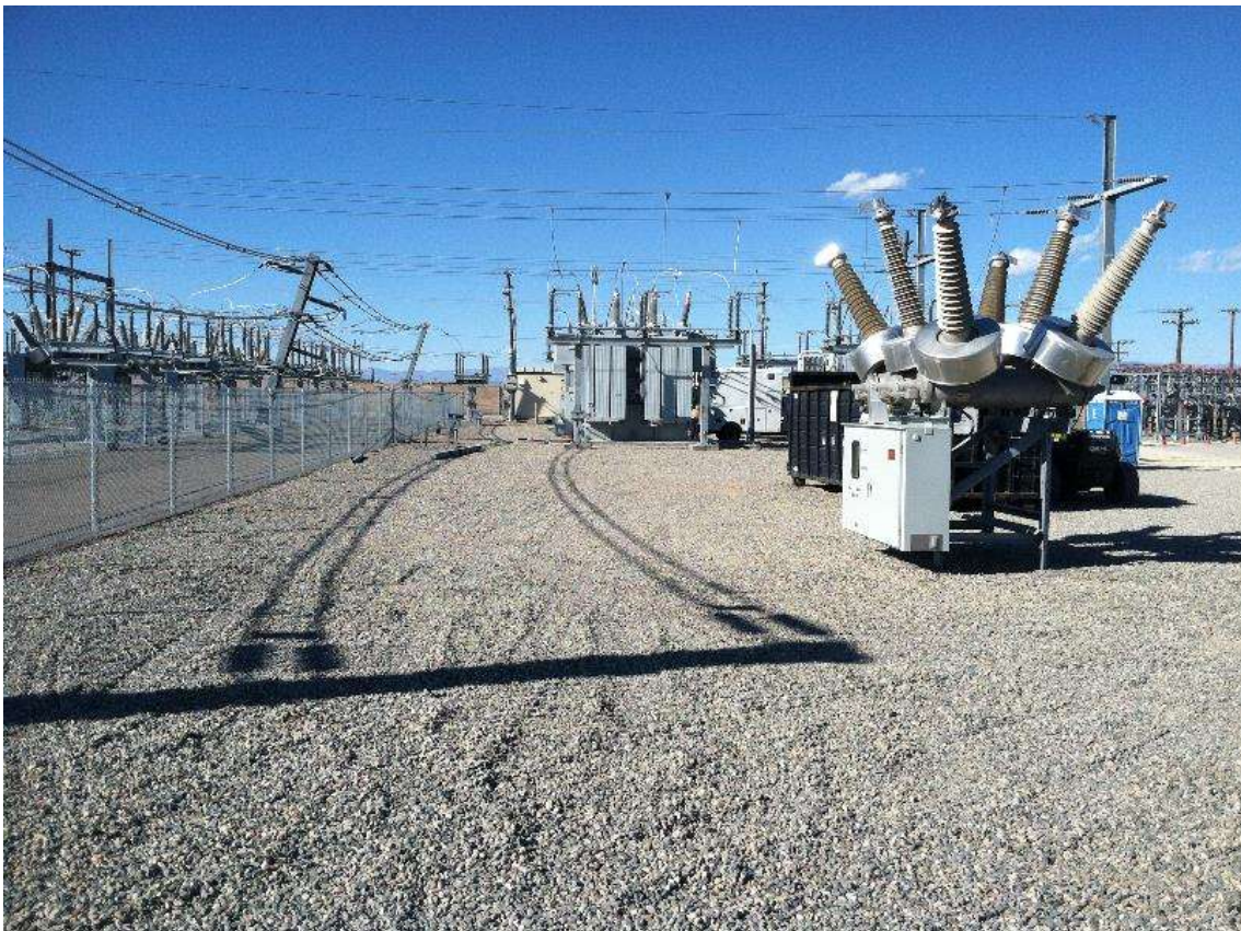
Figure 3 – Stored materials and equipment were removed from the site during the during the subject period. View north, 03/17/16 above, 03/22/16 below.