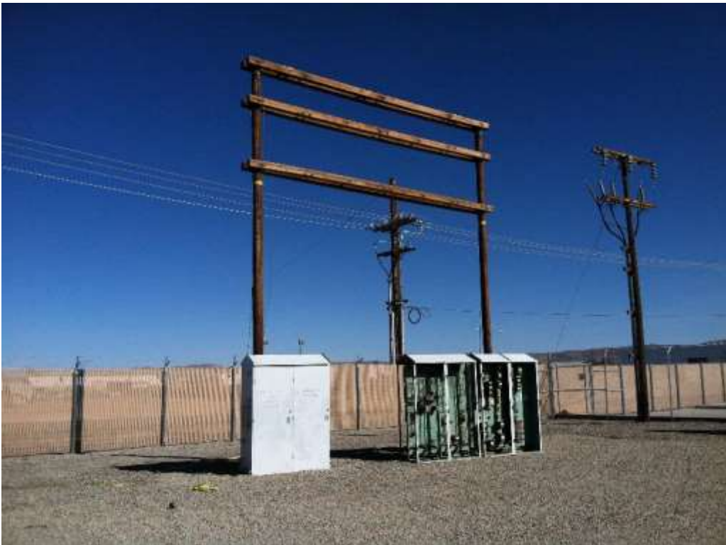
Figure 2 – Some additional structure demolition work is anticipated. View southeast 03/22/16.