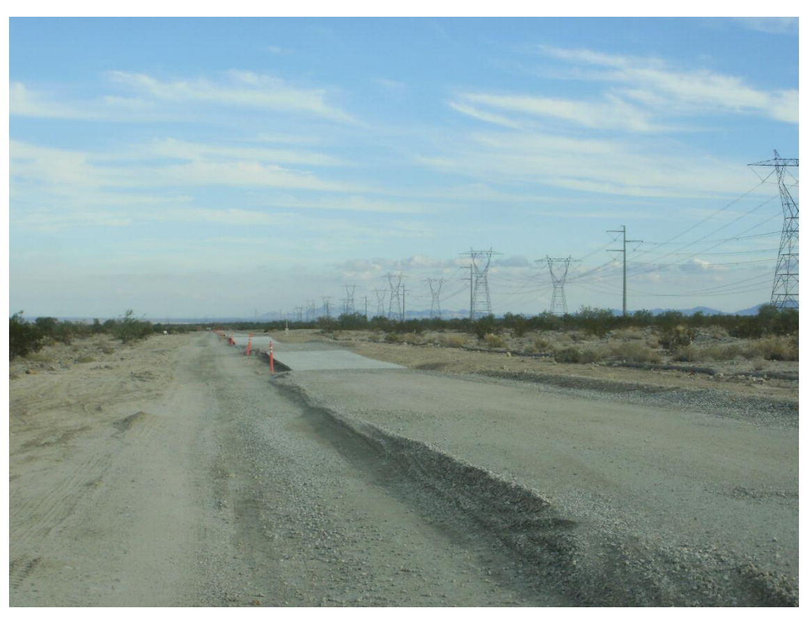
Figure 4. Completed roadway (south side) with Arizona crossings