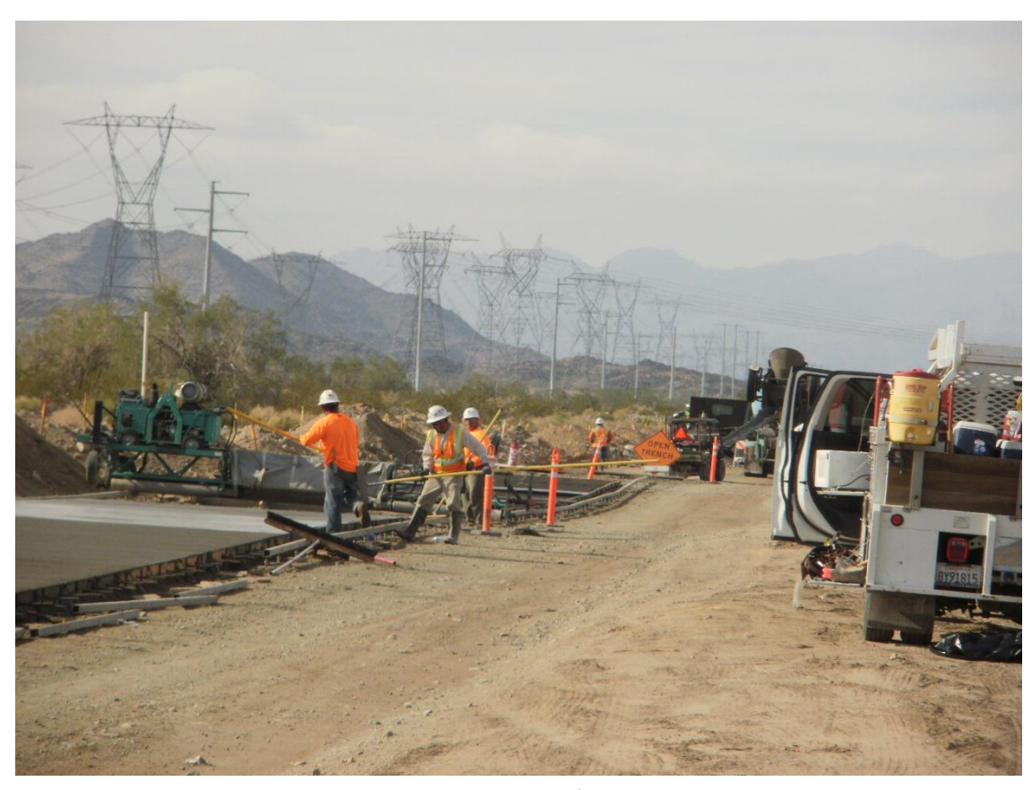
Figure 3. Smoothing concrete for Arizona crossing