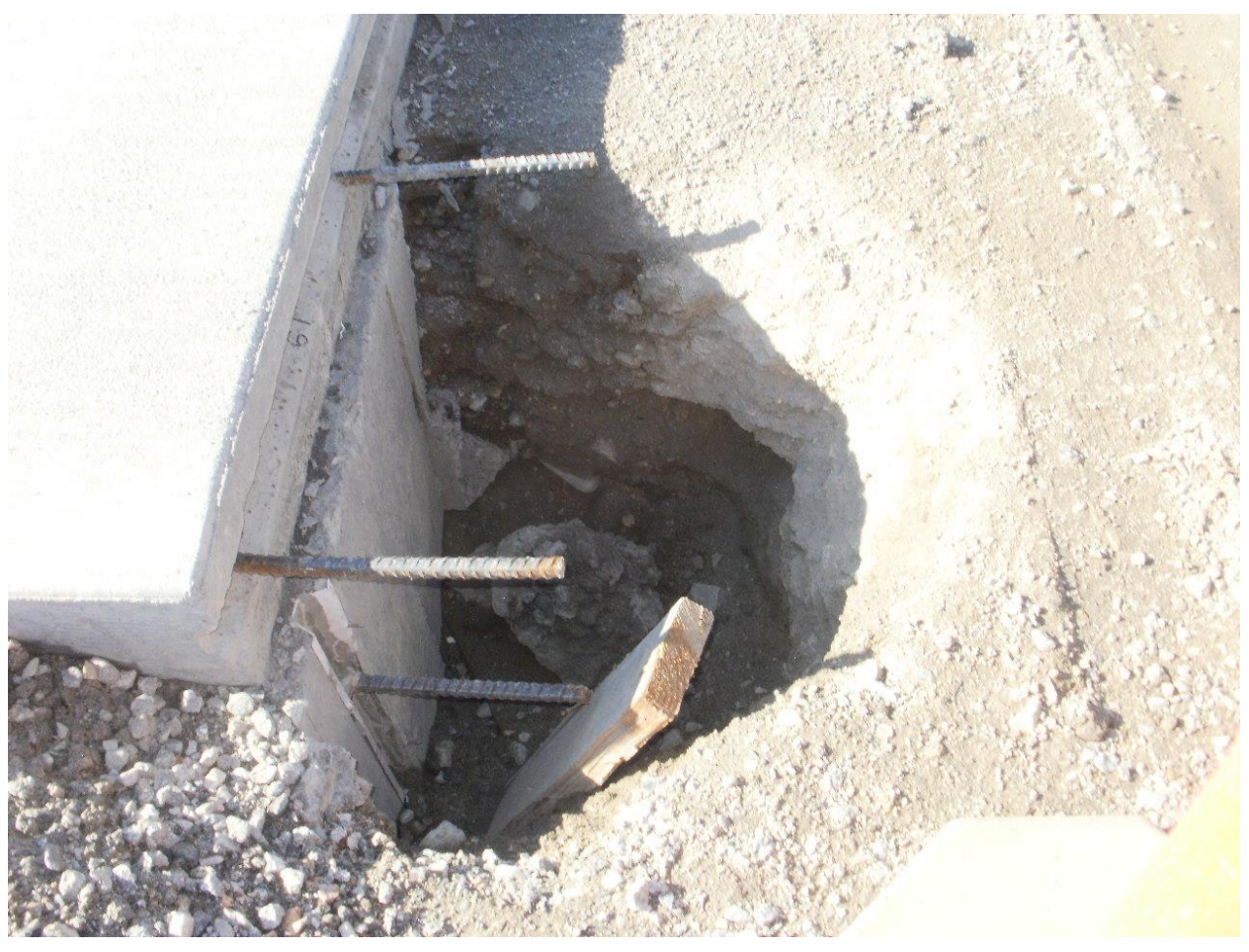
Figure 5. Footer hole with wildlife ramp eroded away. On-site monitors will assess and ensure that crews repair any eroded ramps.