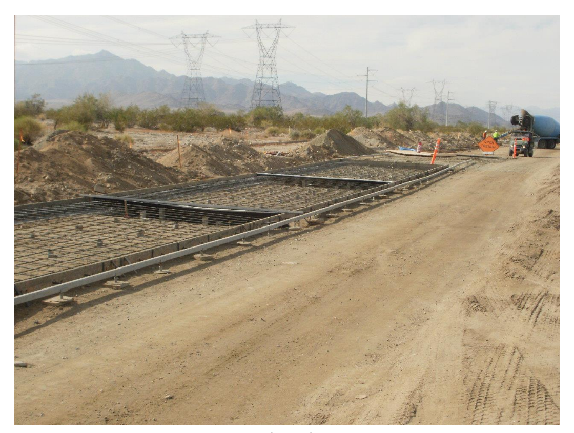
Figure 1. Rebar and forms for Arizona crossing