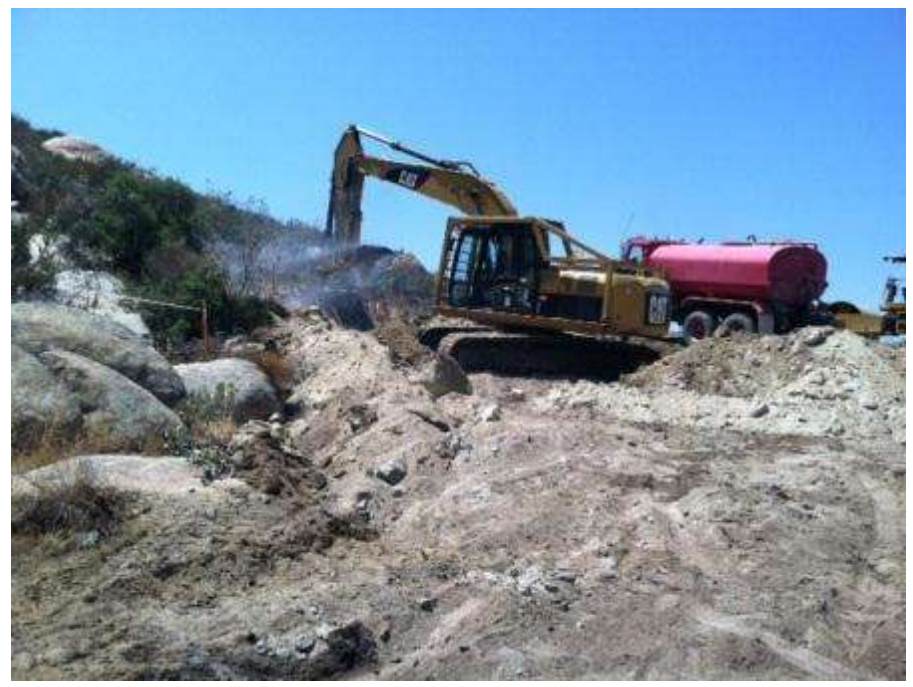
Figure 5. Grading activities at Tower 1093.