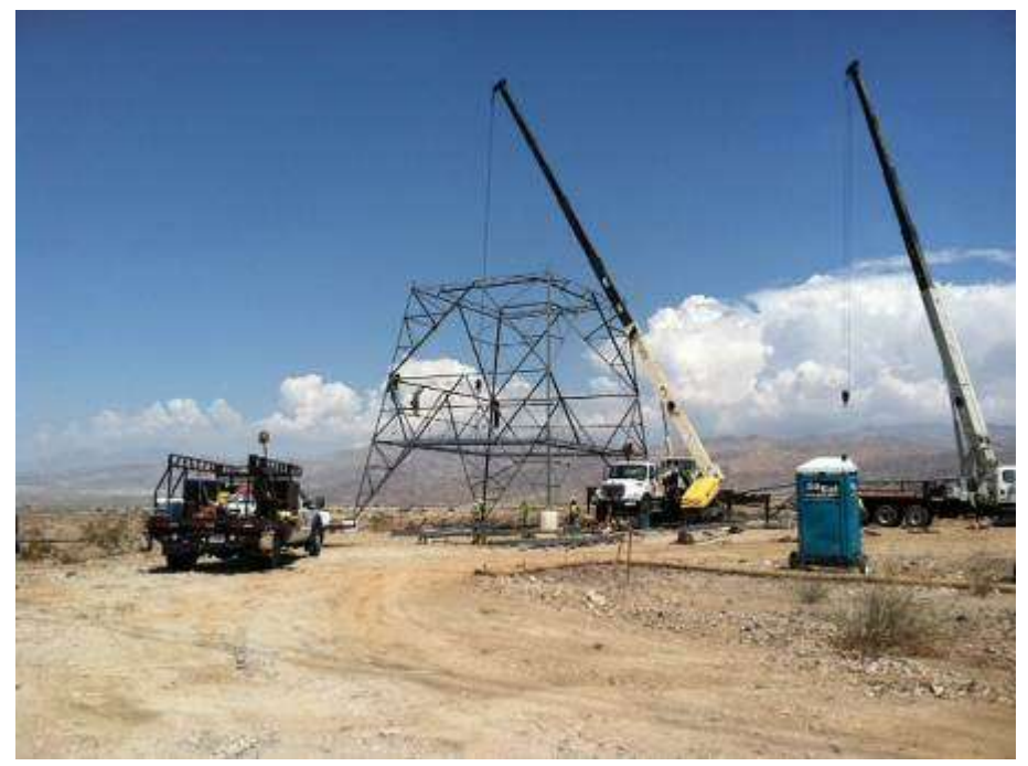
Figure 4. Tower erection activities at Tower 2250.