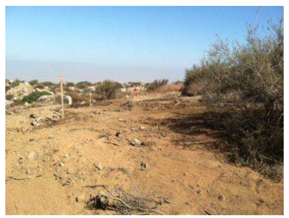
Figure 8. Impacts outside of the disturbance area boundaries for Tower 1140. The impacts are on the right side of the stakes in the photograph.