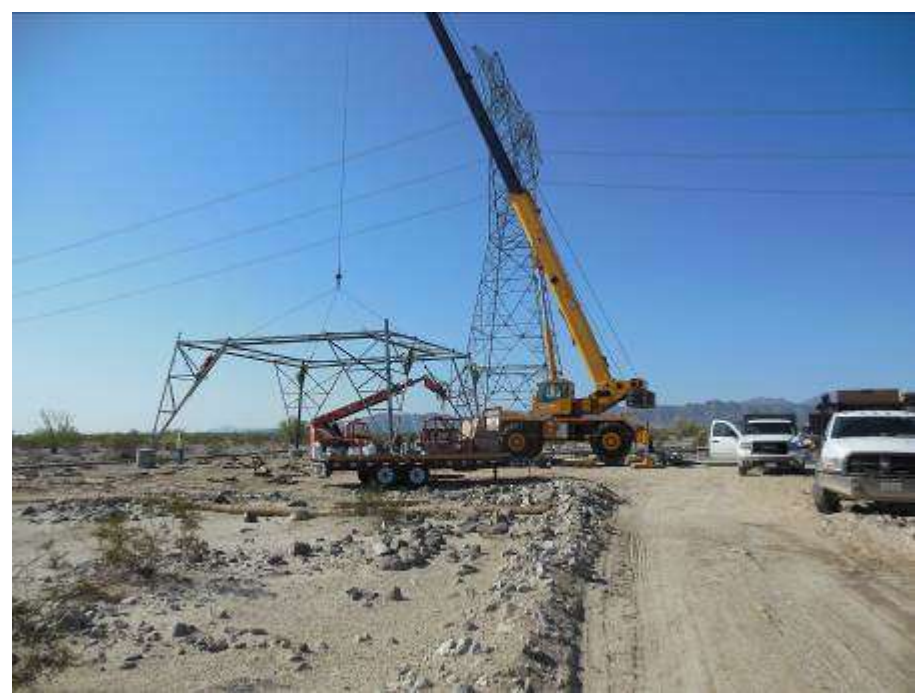
Figure 1. Assembly activities at Tower 2542.