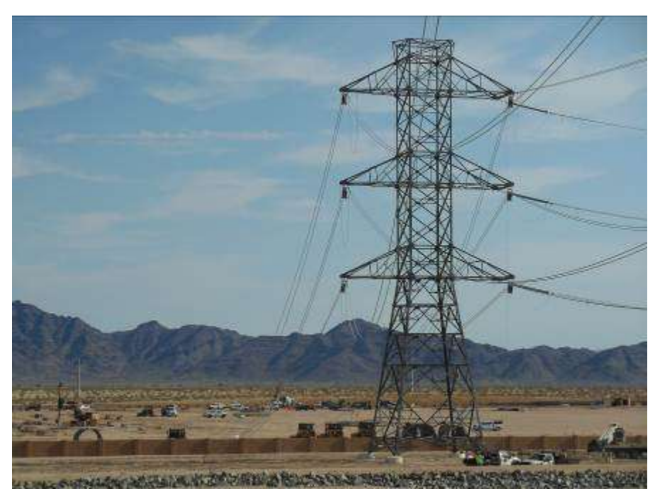
Figure 2. Stringing activities at the CRS loop-in towers.