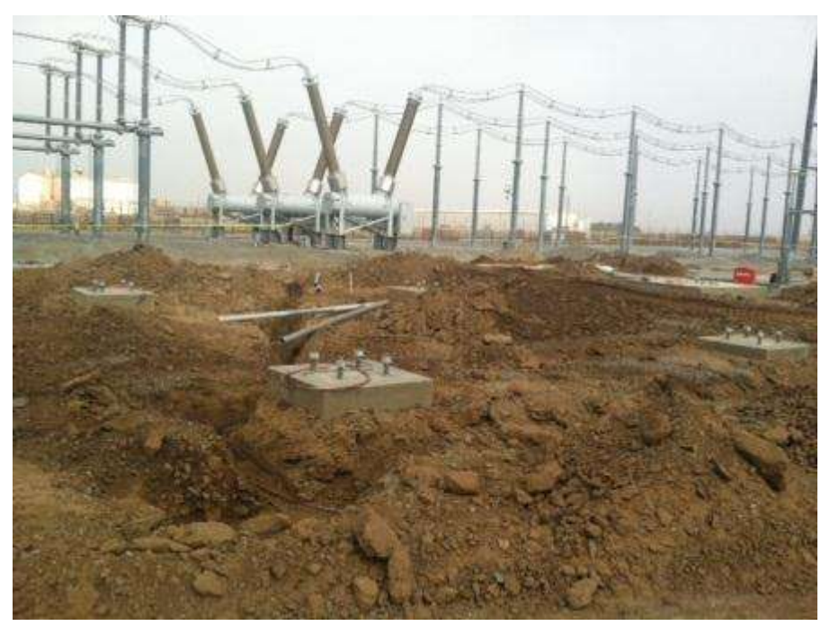
Figure 10. Trenching for the grounding wires for foundations within the Valley Substation.