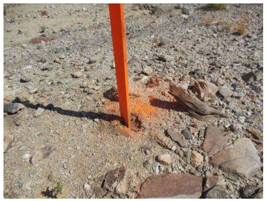
Figure 9. Spray paint left on ground during survey staking.