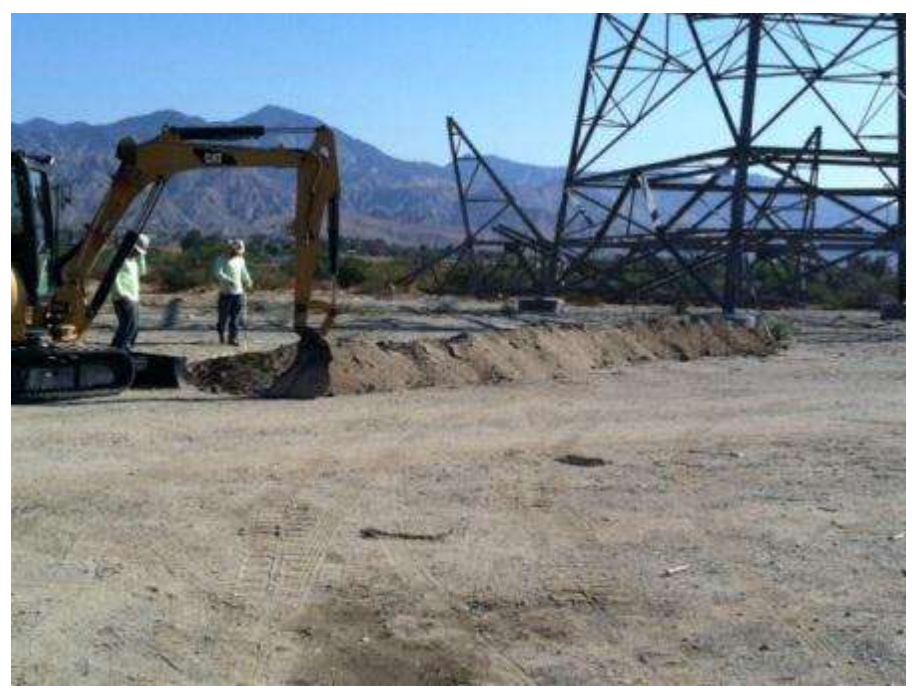
Figure 7. Trenching for grounding wire at Tower 1061.