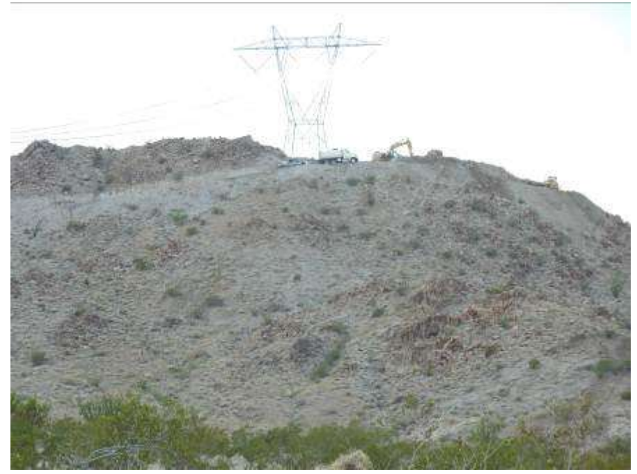
Figure 3. Grading/site clearing activities at Tower 2416.