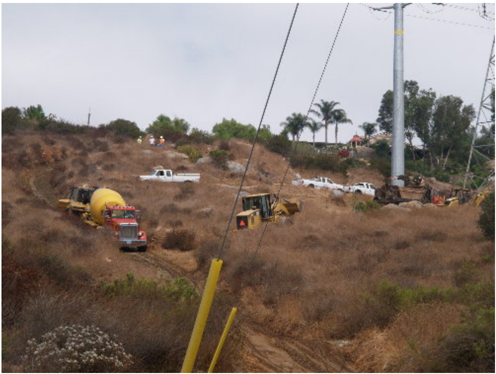
Figure 2 – The concrete trucks were pulled up the steep slope by the bulldozer.