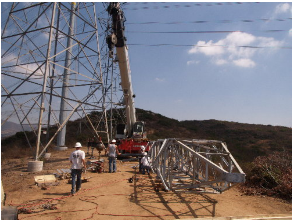
Figure 4 – The Wilson tower modification crew worked above Steele Canyon High School during the site visit.