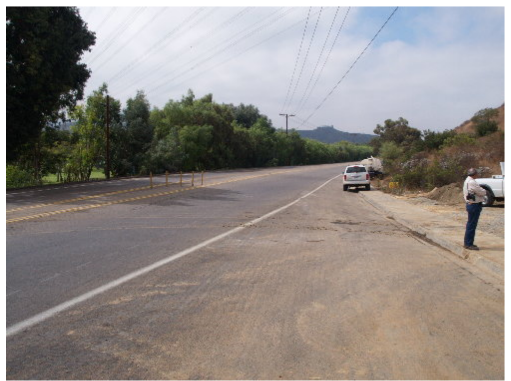
Figure 5 – All material tracked onto the public right-of-way is cleaned up at the end of each shift.