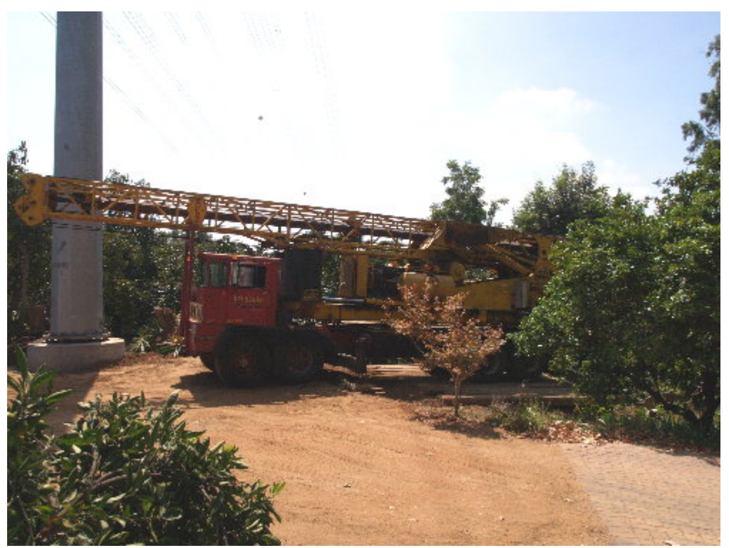
Figure 3 – The Tri-State drilling crew set up the drilling machine at Singing Vista.