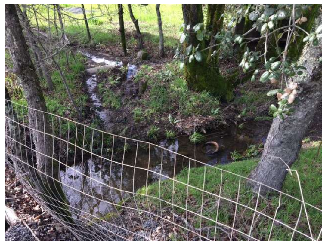
Figure 4 – Unnamed drainage north of substation site running clear – view north, February 10, 2017.