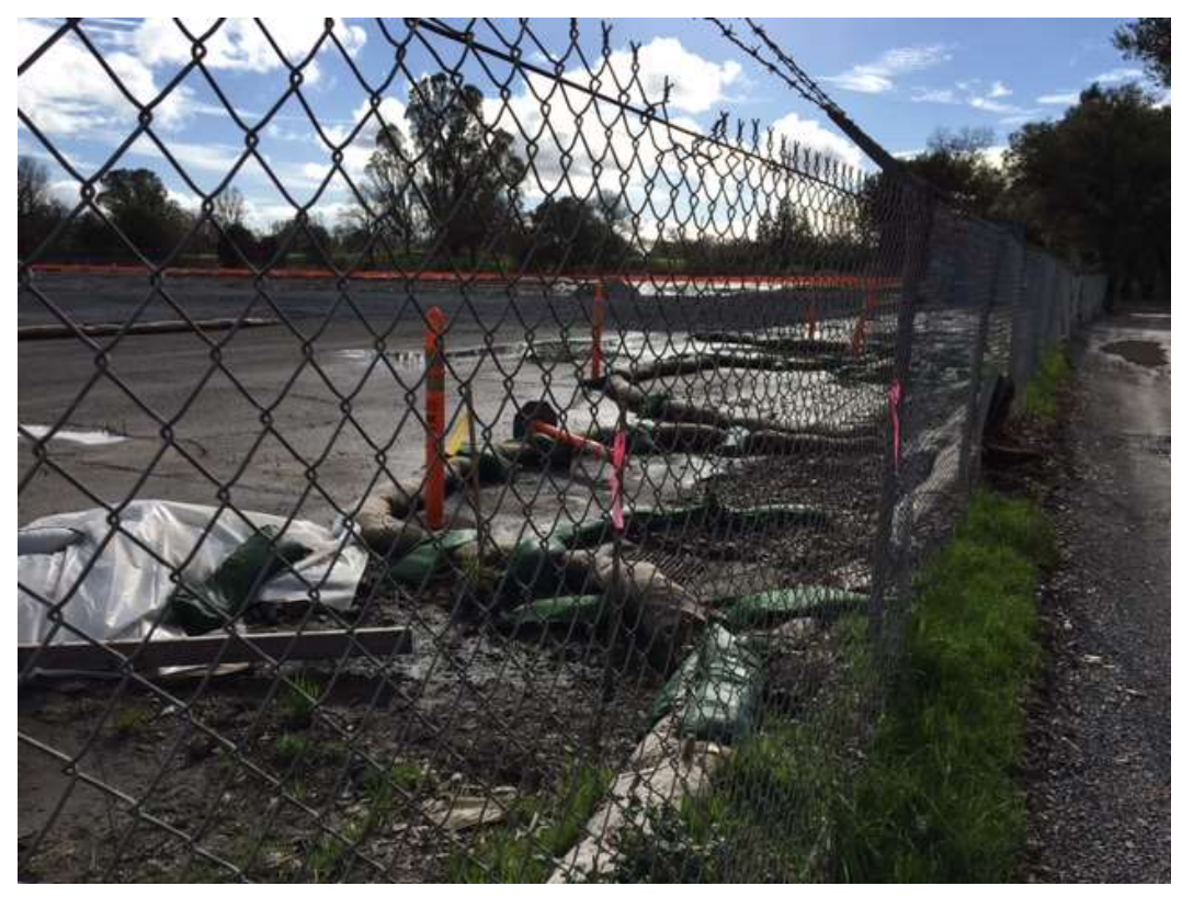
Figure 3 – Drainage inlets protected at substation site – view southwest, February 10, 2017.