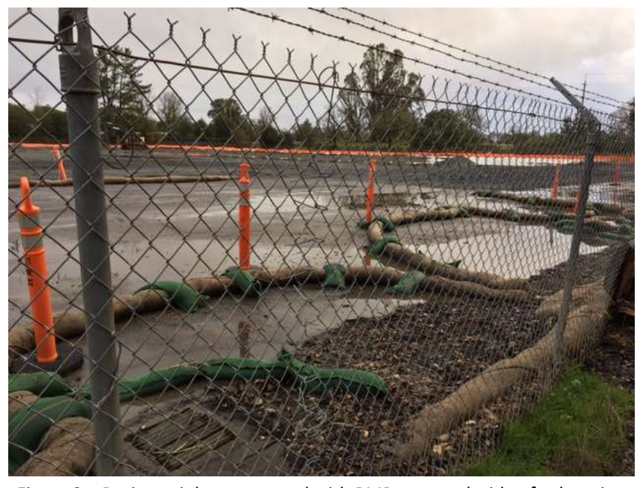
Figure 2 – Drainage inlets protected with BMPs on north side of substation site – view southwest, February 3, 2017.