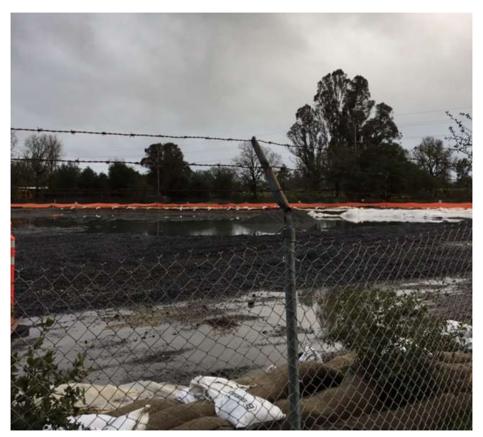
Figure 1 – Standing water at substation site – view southwest, February 3, 2017.