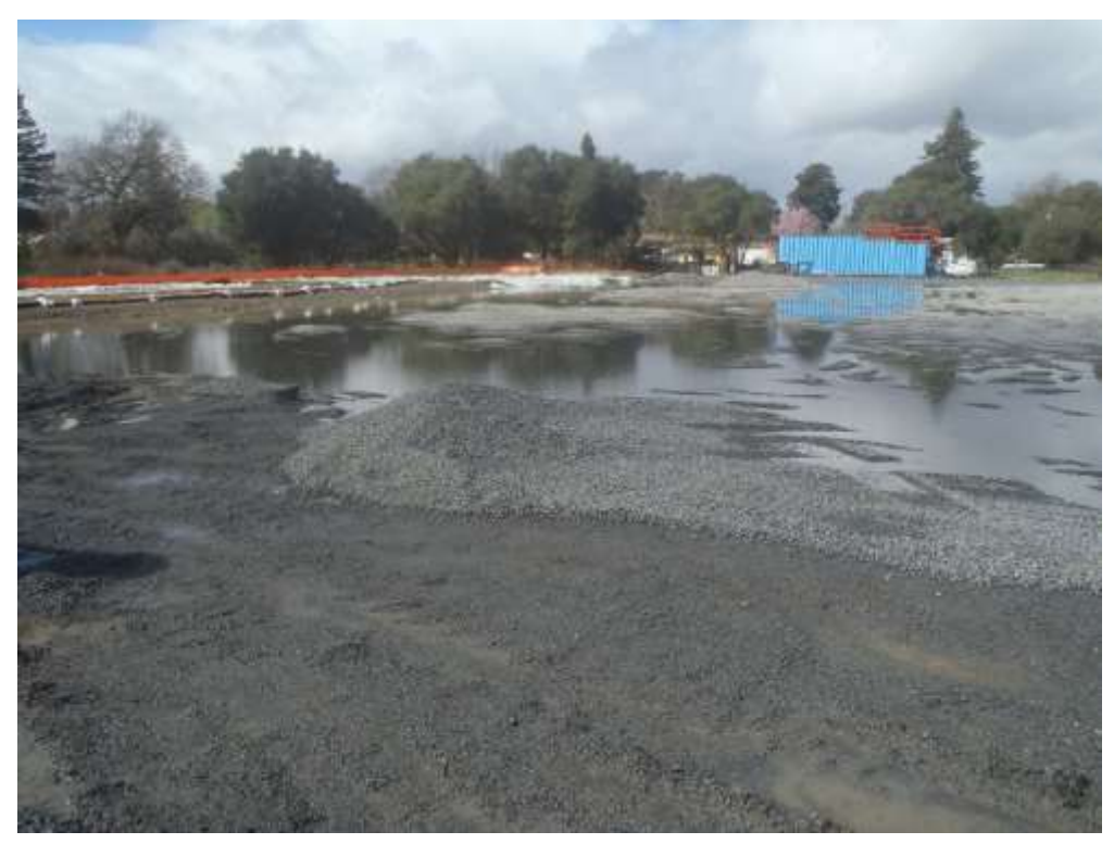
Figure 1 – No work at substation site – view northwest, February 27, 2017.