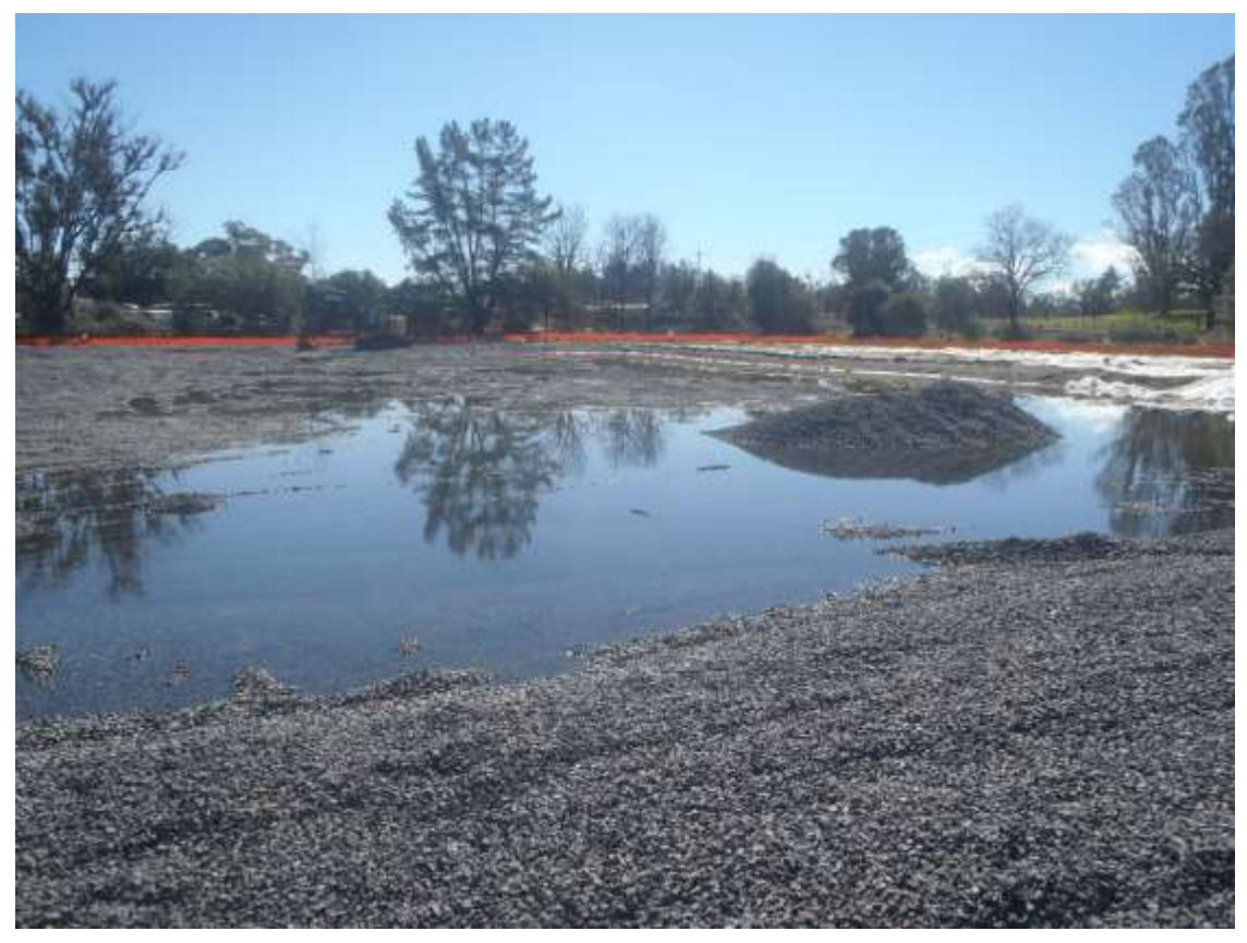
Figure 3 – Middle area of substation site – view southwest, March 6, 2017.