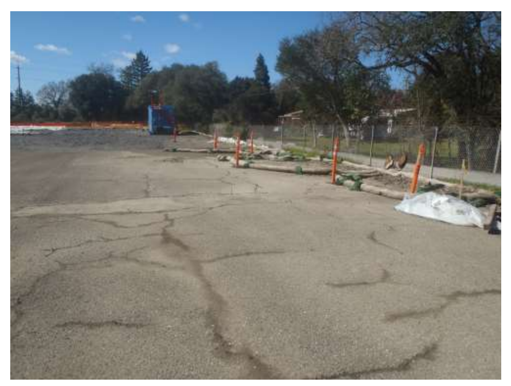
Figure 2 – Drainage inlets protected with BMPs on north side of substation site – view west, February 27, 2017.