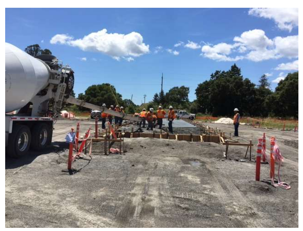
Figure 2 – Pouring cement for switchgear foundation at the substation site – view west, May 15, 2017.