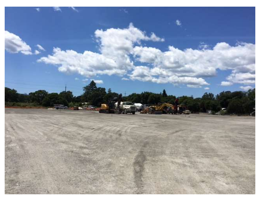
Figure 1 – Substation site and pad – view northwest, May 15, 2017.