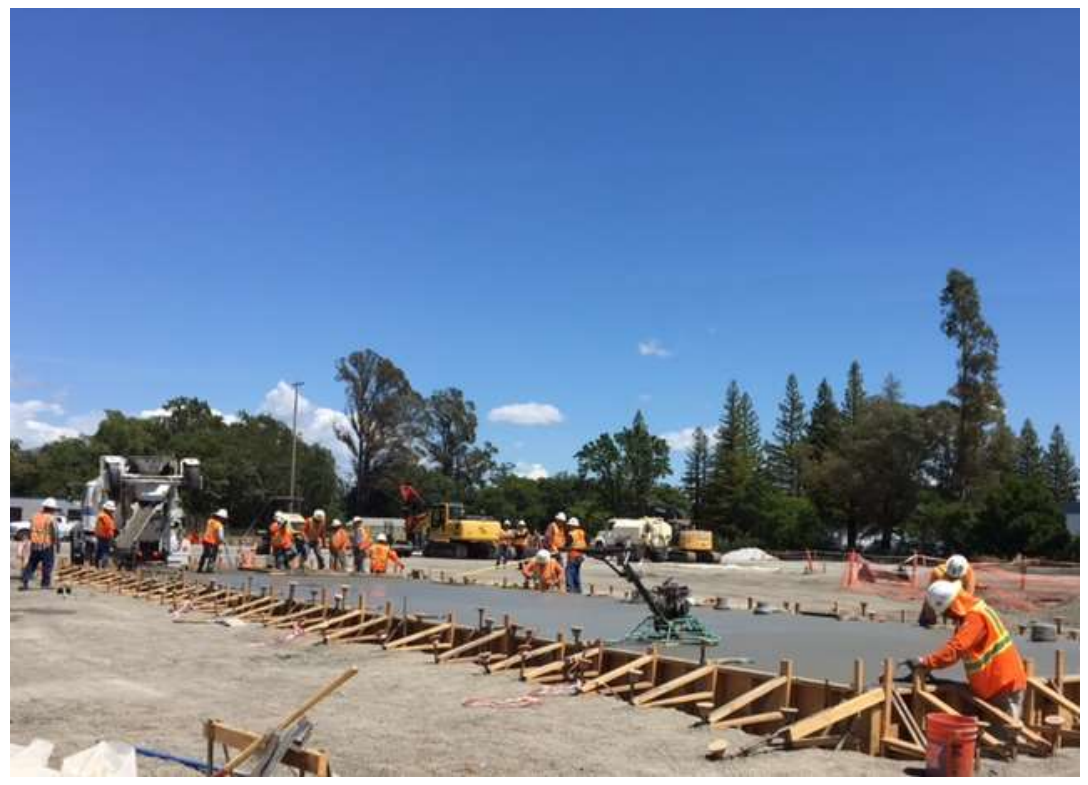
Figure 3 – Pouring and setting cement for switchgear foundation at substation site – view southeast, May 15, 2017.