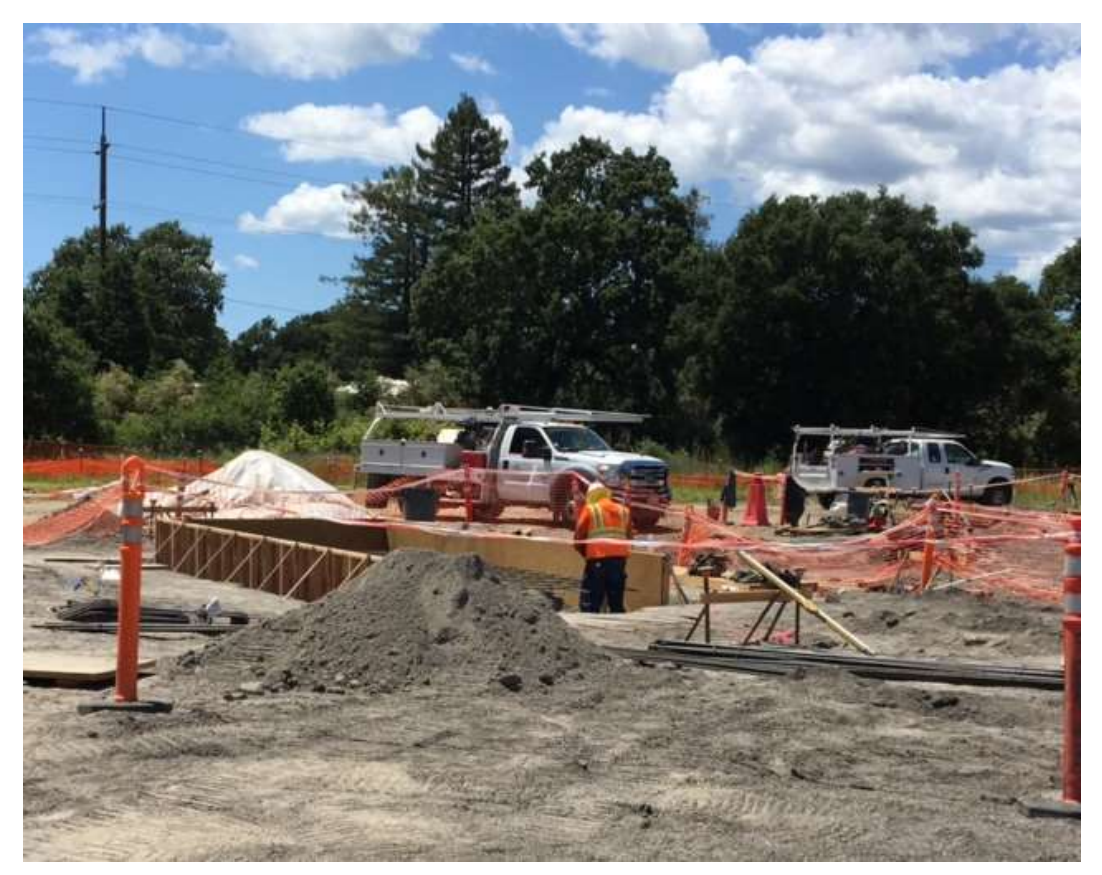
Figure 4 – Transformer foundation work at substation site – view northwest, May 15, 2017.