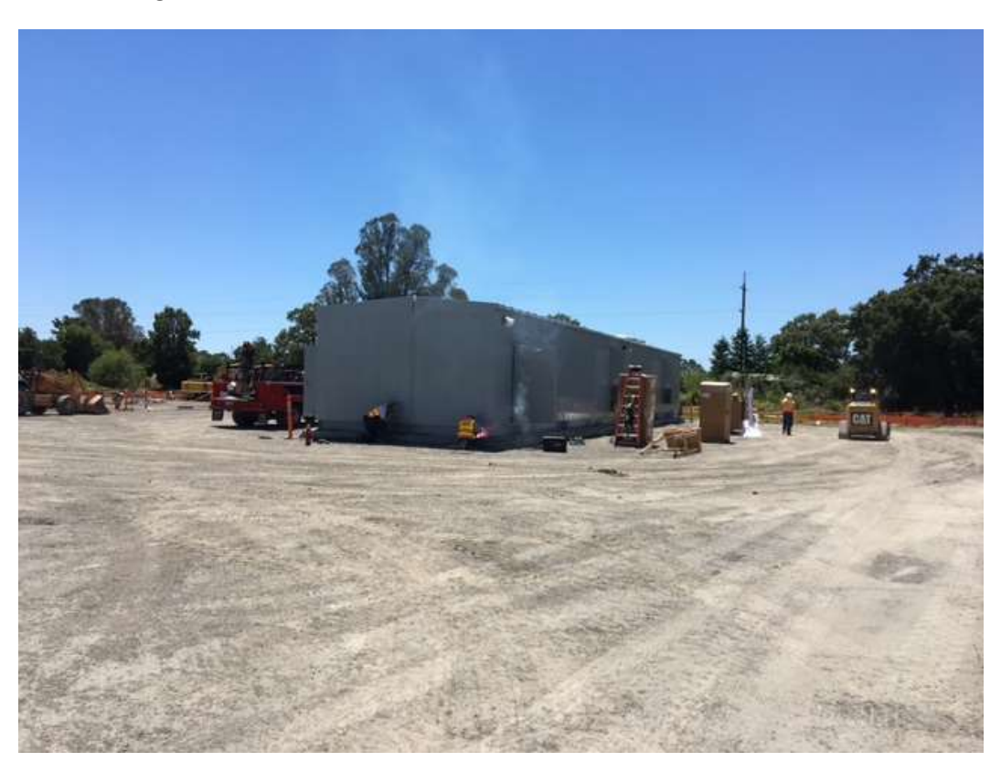
Figure 2 – Switchgear assembly and welding – view west, June 13, 2017.