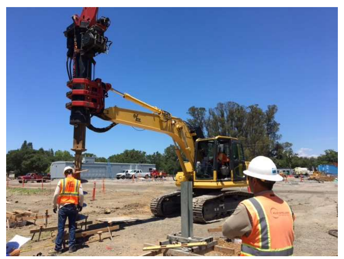
Figure 4 – Drilling for perimeter fence on west side of substation site – view northeast, June 13, 2017.