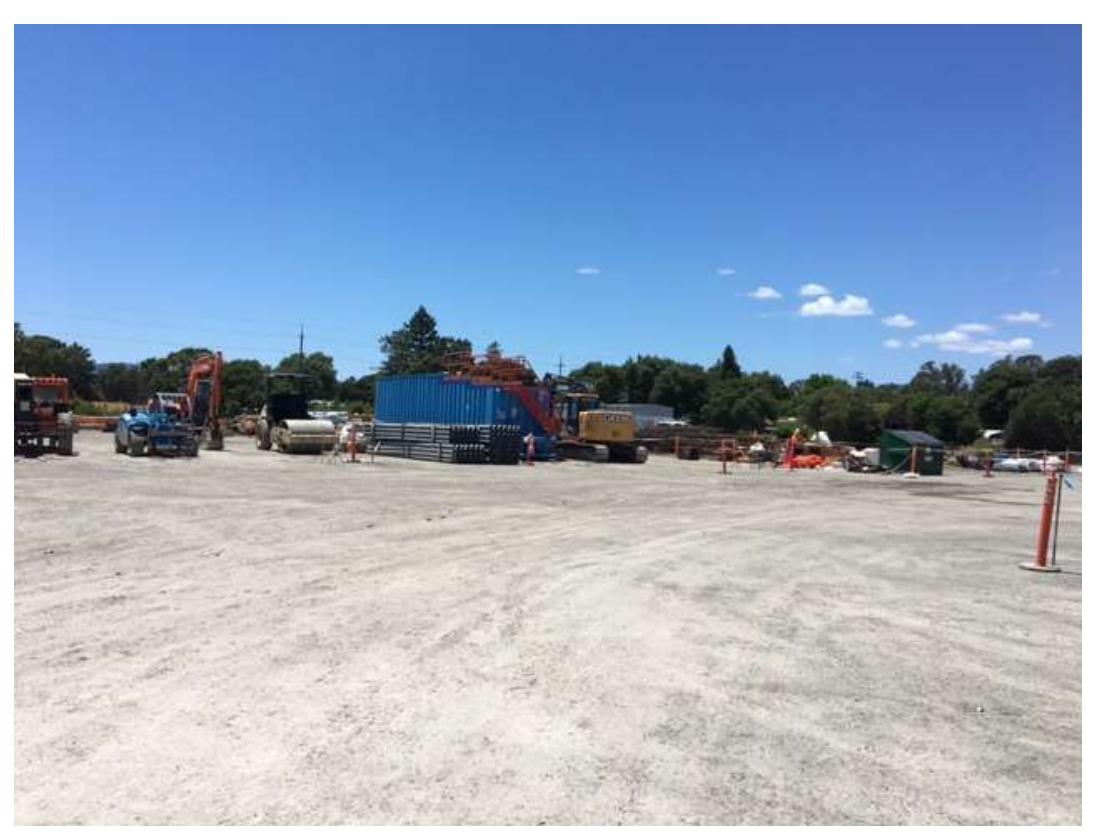
Figure 1 – Work at substation site – view northwest, June 13, 2017.