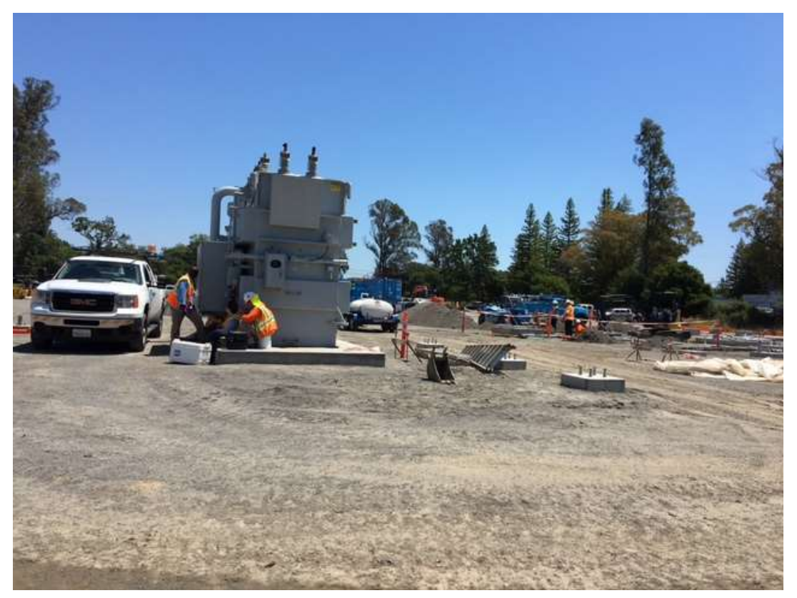
Figure 4 – Transformer set at substation site – view east, June 20, 2017.