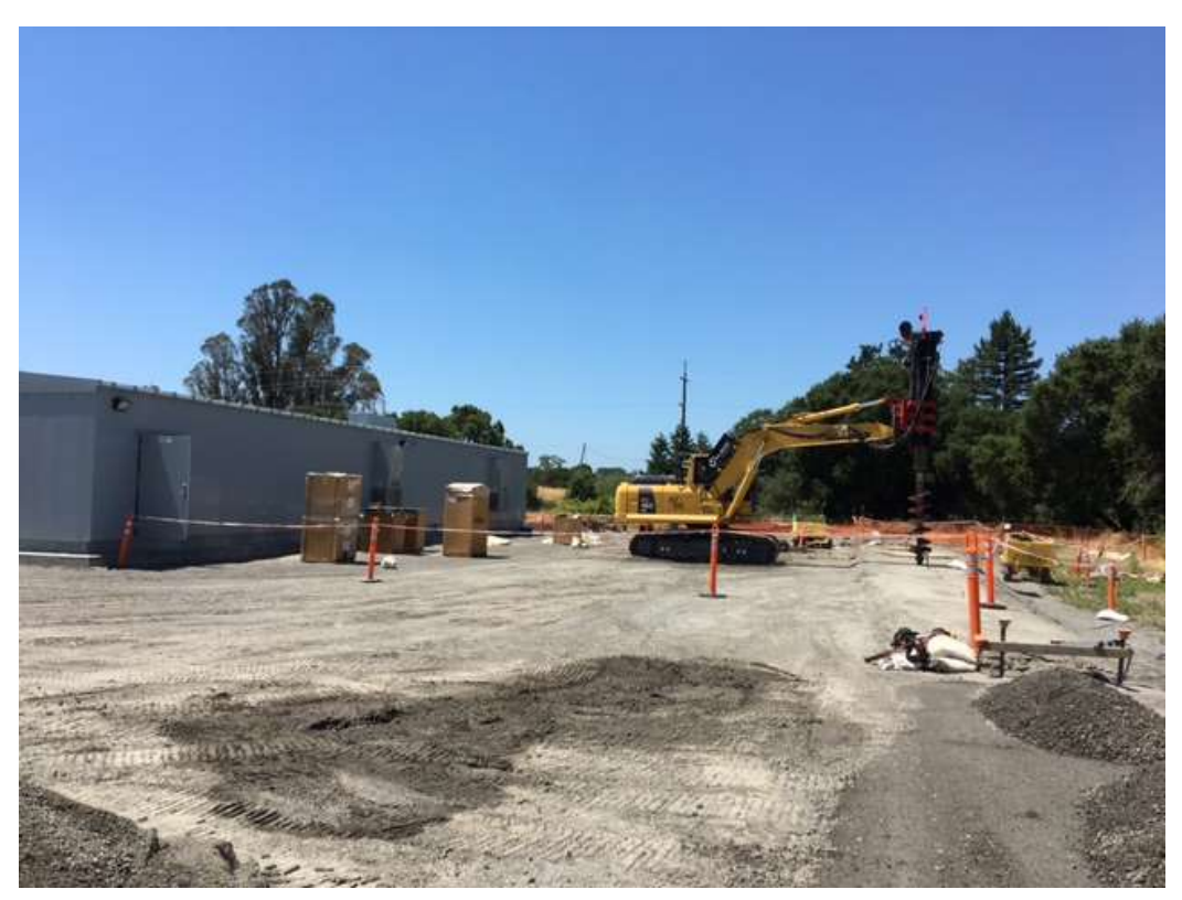
Figure 2 – Drilling foundation holes for perimeter fence on north side of substation – view west, June 20, 2017.