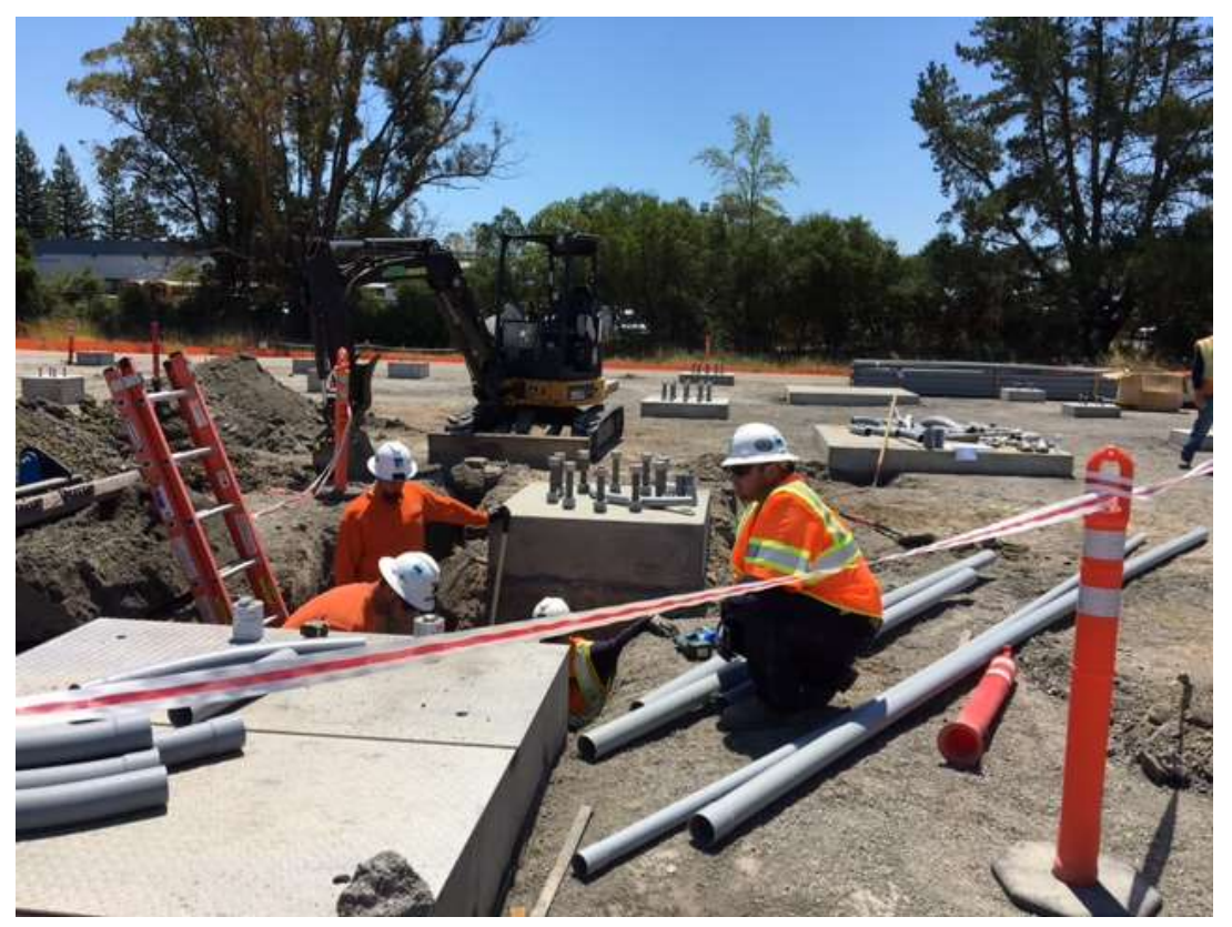
Figure 3 – Conduit work at substation site – view south, June 20, 2017.