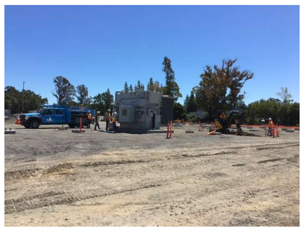
Figure 2 – Transformer and foundation work – view southeast, July 6, 2017.