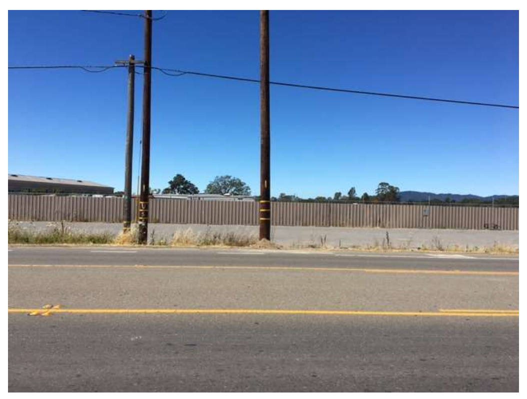
Figure 3 – Replacement Pole b9 on west side of Old Redwood Highway – view west, July 6, 2017.