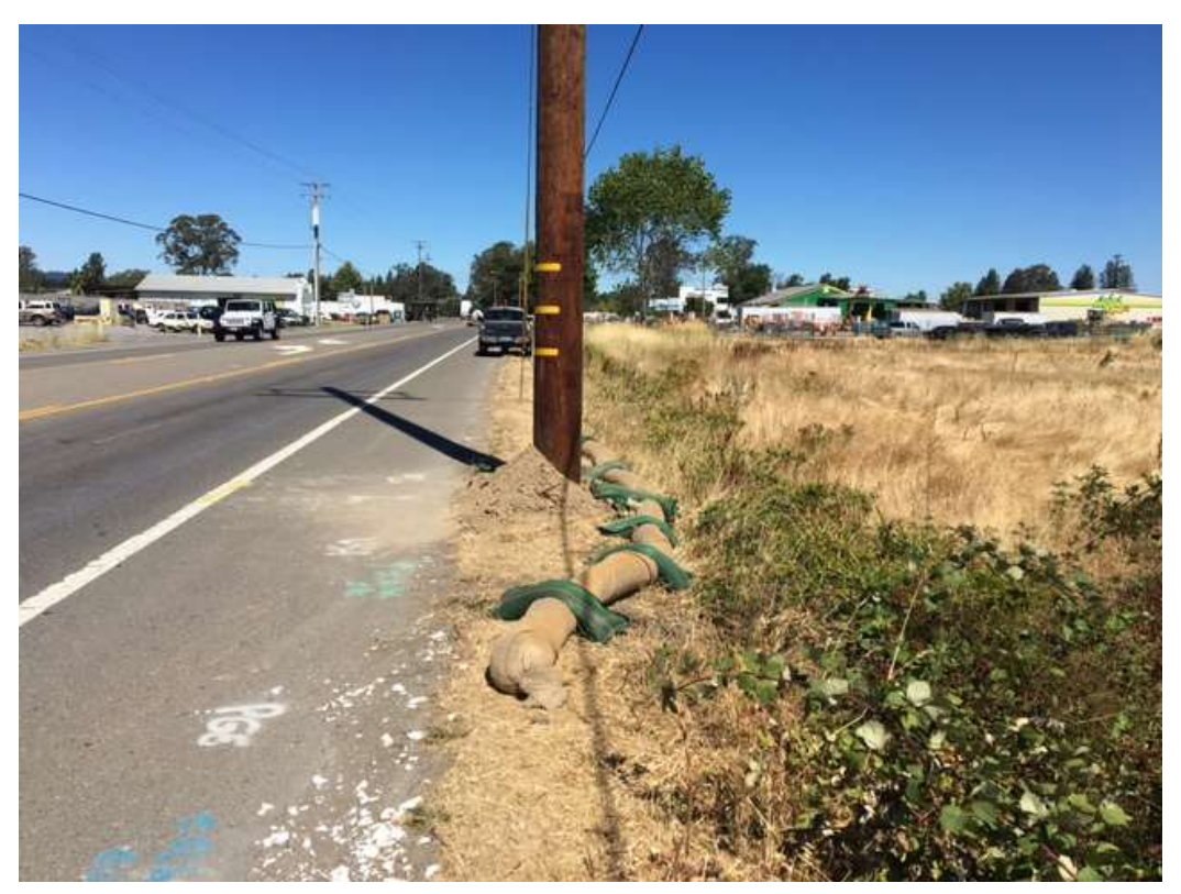
Figure 4 – New Pole b9a installed on east side of Old Redwood Highway – view north, July 6, 2017.