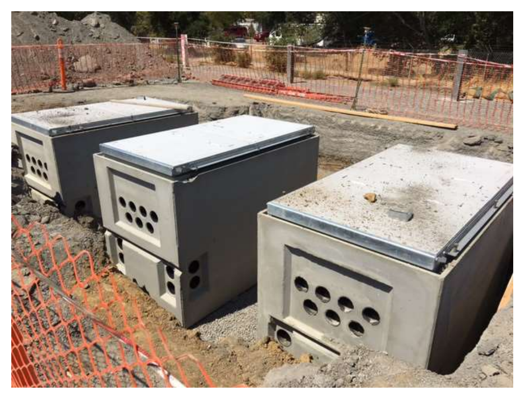
Figure 3 – Last two pull boxes set on northern perimeter – view northwest, August 18, 2017.