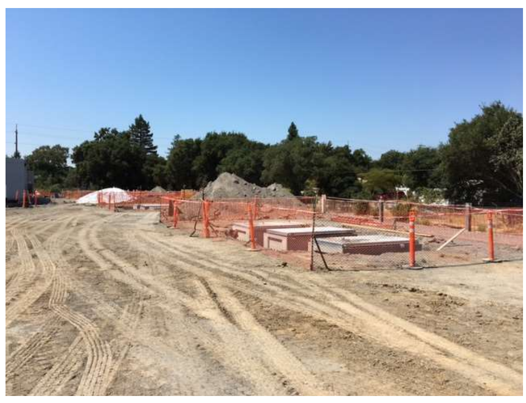
Figure 2 – Pull boxes set on northern perimeter – view northwest, August 18, 2017.