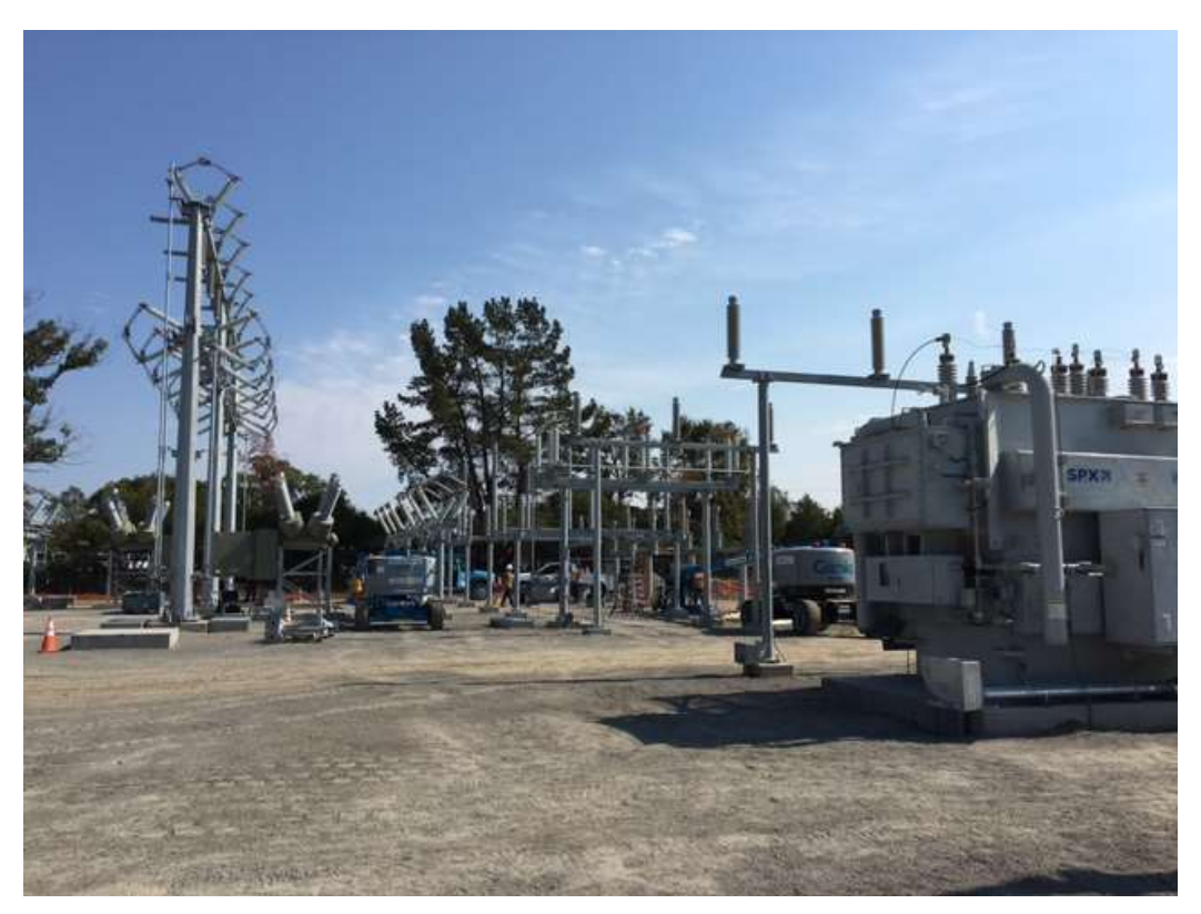
Figure 3 – Installing switches and insulators on dead-end structures – view south, September 6, 2017.