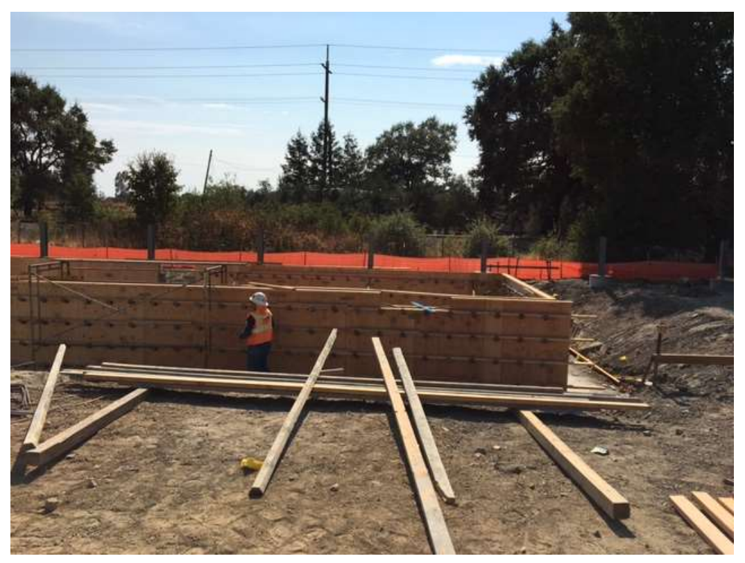
Figure 2 – Installing rebar and wall panel forms in the SPCC ponds – view west, September 6, 2017.