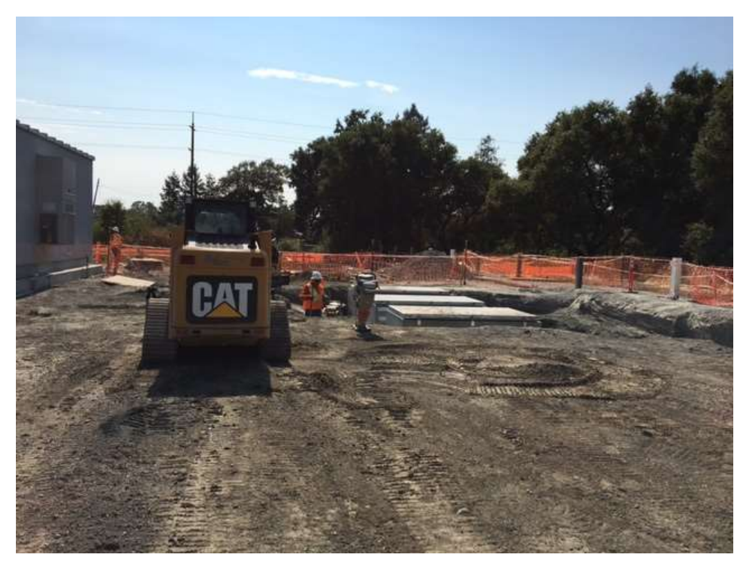
Figure 1 – Excavating trenches and installing conduit to pull boxes – view west, September 6, 2017.