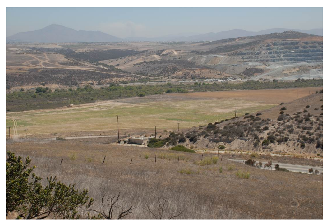
Viewpoint 8: Existing view looking northeast from the end of Vista Santa Rosalia in a residential neighborhood near Dennery Canyon.