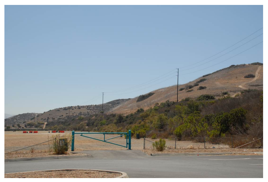
Viewpoint 6: View looking southeast from the parking lot of the Sleep Train Amphitheatre.