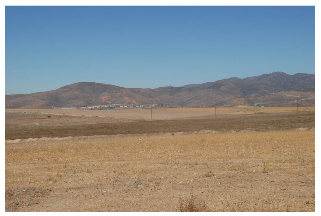
Viewpoint 16: Existing view looking east from SR-125, approximately 0.5 mile north of Otay Mesa Road.