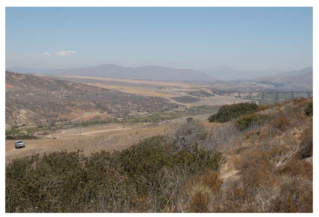
Viewpoint 12: Existing view looking northeast from an undeveloped mesa.