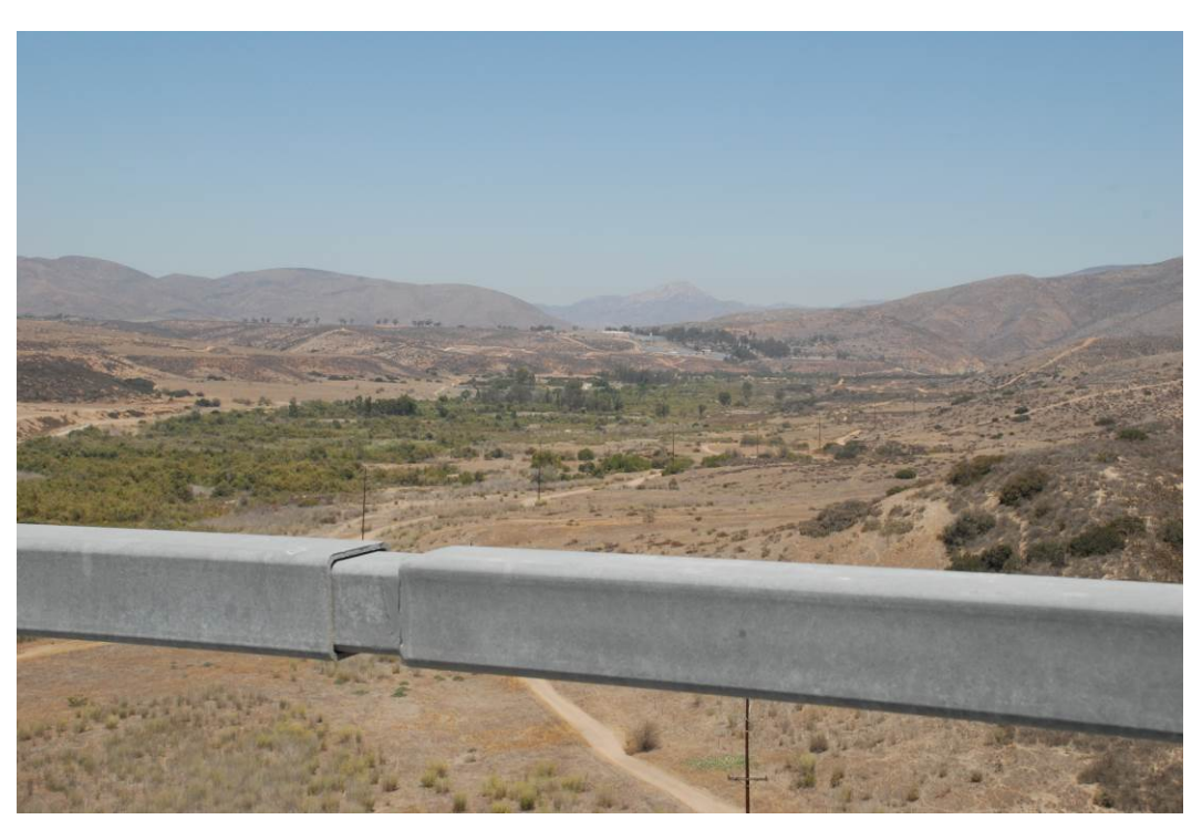
Viewpoint 15: Existing passenger view looking east-northeast from State Route (SR-) 125.