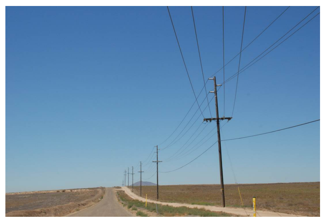
Viewpoint 18: Existing view looking north from Otay Mesa Road along Harvest Road. The fifth pole from the foreground represents the eastern terminus of the Proposed Project.