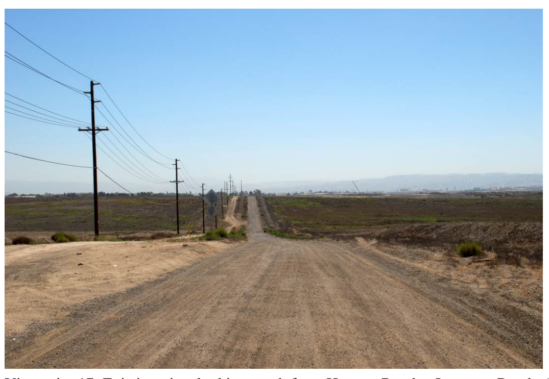
Viewpoint 17: Existing view looking south from Harvest Road at Lonestar Road. (A simulation of Viewpoint 17 is included in Attachment 4.1-B: Visual Simulations.)