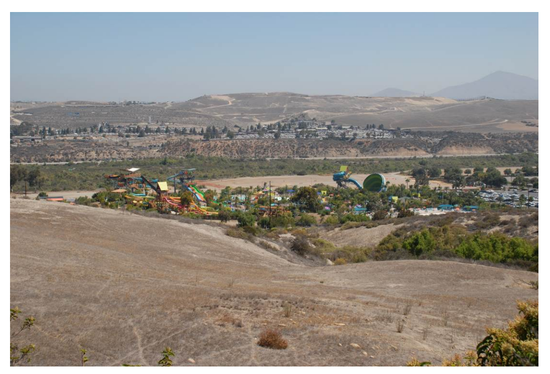
Viewpoint 4: View from the north side of the sidewalk on Avenida de las Vistas looking north. The Aquatica San Diego water park is in the background.