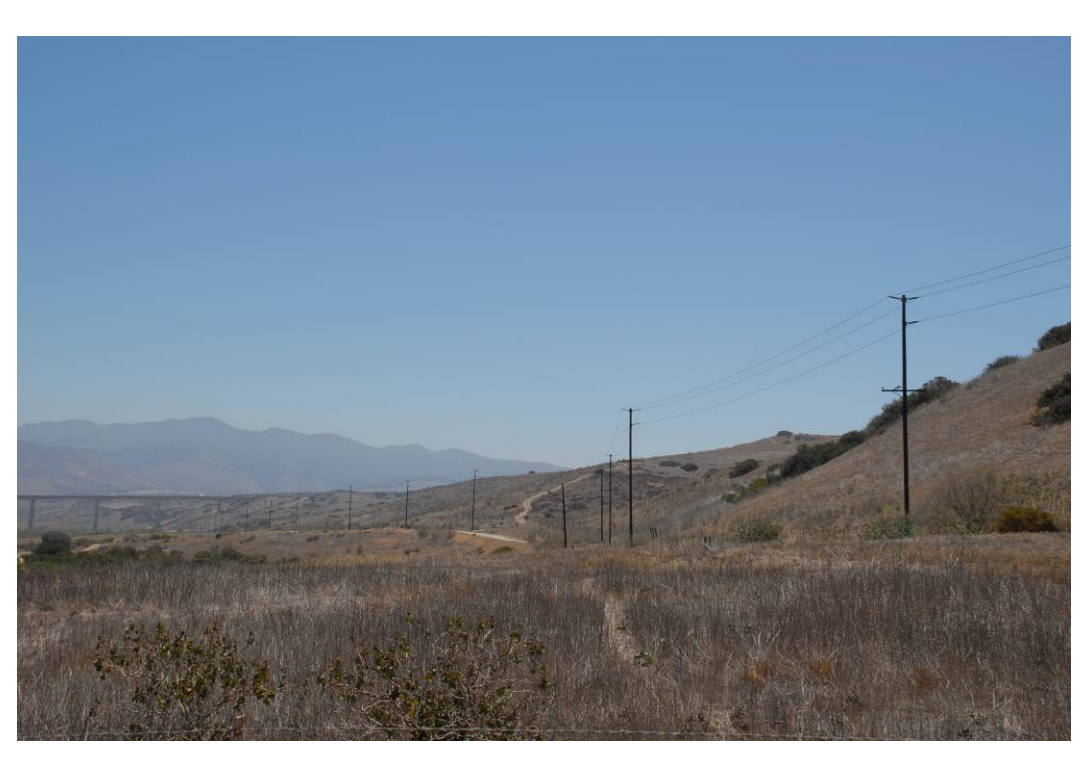
Viewpoint 11: Existing view to the east-southeast from an open space area within the Otay River Valley. (A simulation of Viewpoint 11 is included in Attachment 4.1-B: Visual Simulations.)