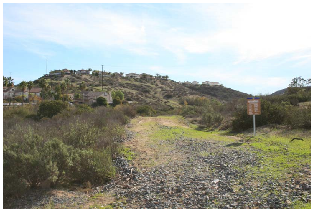
Viewpoint 2: Existing view looking southeast from Dennery Road west of Topside Lane. (A simulation of Viewpoint 2 is included in Attachment 4.1-B: Visual Simulations.)