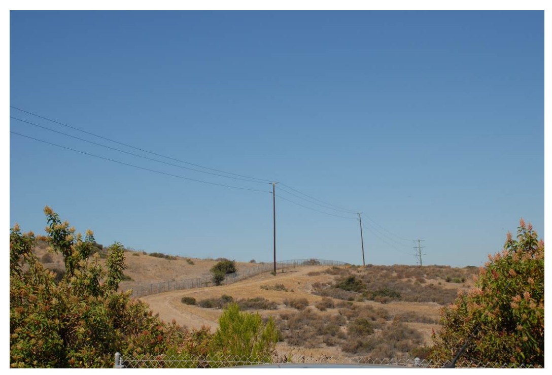
Viewpoint 2A: Existing view looking west-southwest from Dennery Road west of Topside Lane. (A simulation of Viewpoint 2A is included in Attachment 4.1-B: Visual Simulations.)