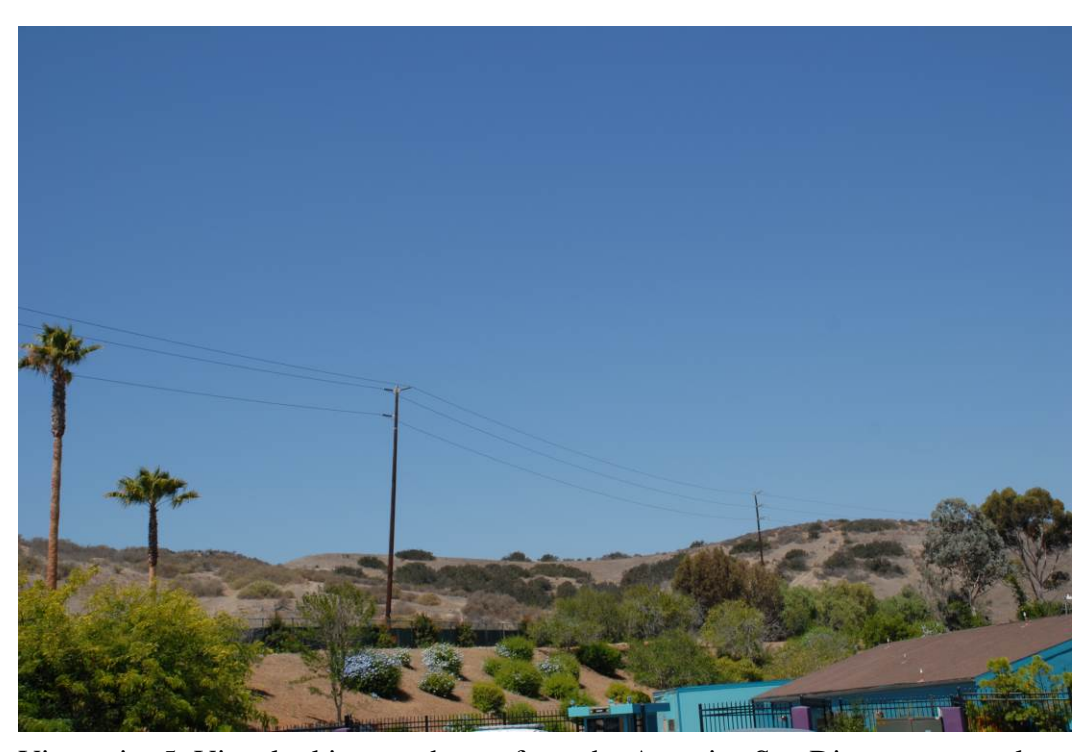
Viewpoint 5: View looking southwest from the Aquatica San Diego water park.