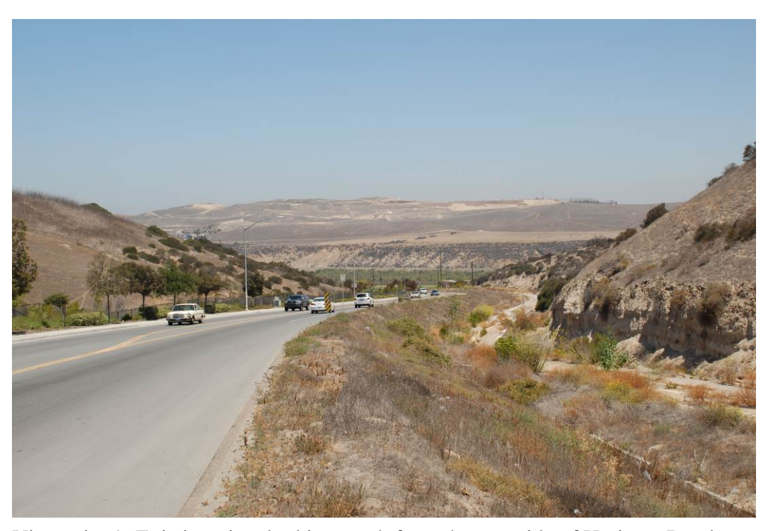
Viewpoint 9: Existing view looking north from the east side of Heritage Road.