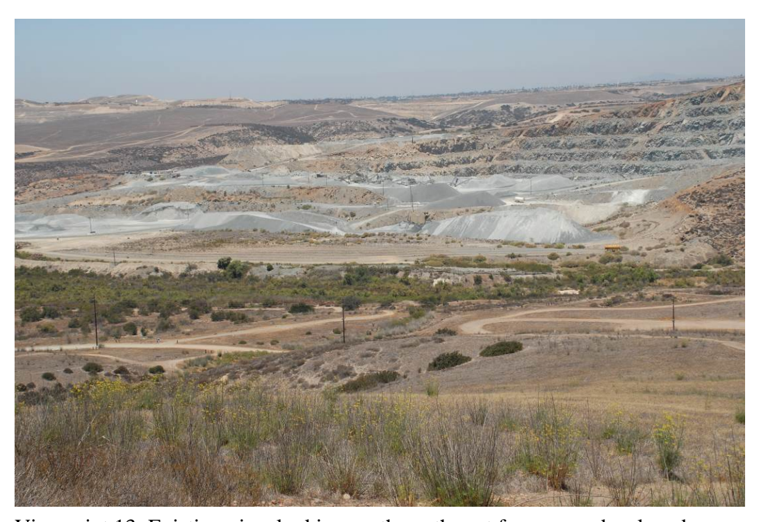
Viewpoint 13: Existing view looking north-northwest from an undeveloped mesa.