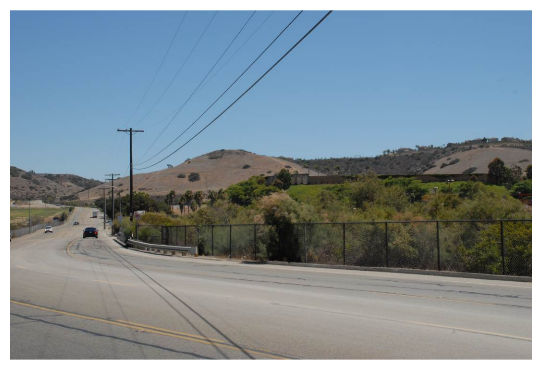
Viewpoint 14: Existing view looking south from Main Street at Heritage Road. Proposed Project poles would be located approximately 0.5 mile away in the middleground of the photograph. (A simulation of Viewpoint 14 is included in Attachment 4.1-B: Visual Simulations.)