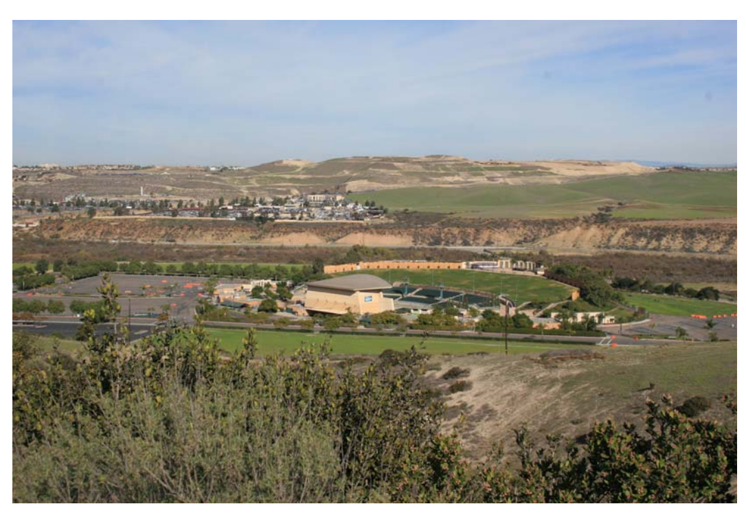
Viewpoint 7: Existing view looking north from the northwest corner of Vista Pacifica Community Park in a residential neighborhood near Dennery Canyon. (A simulation of Viewpoint 7 is included in Attachment 4.1-B: Visual Simulations.)