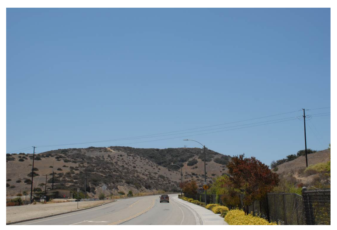
Viewpoint 10: Existing view looking south from Heritage Road. (A simulation of Viewpoint 10 is included in Attachment 4.1-B: Visual Simulations.)