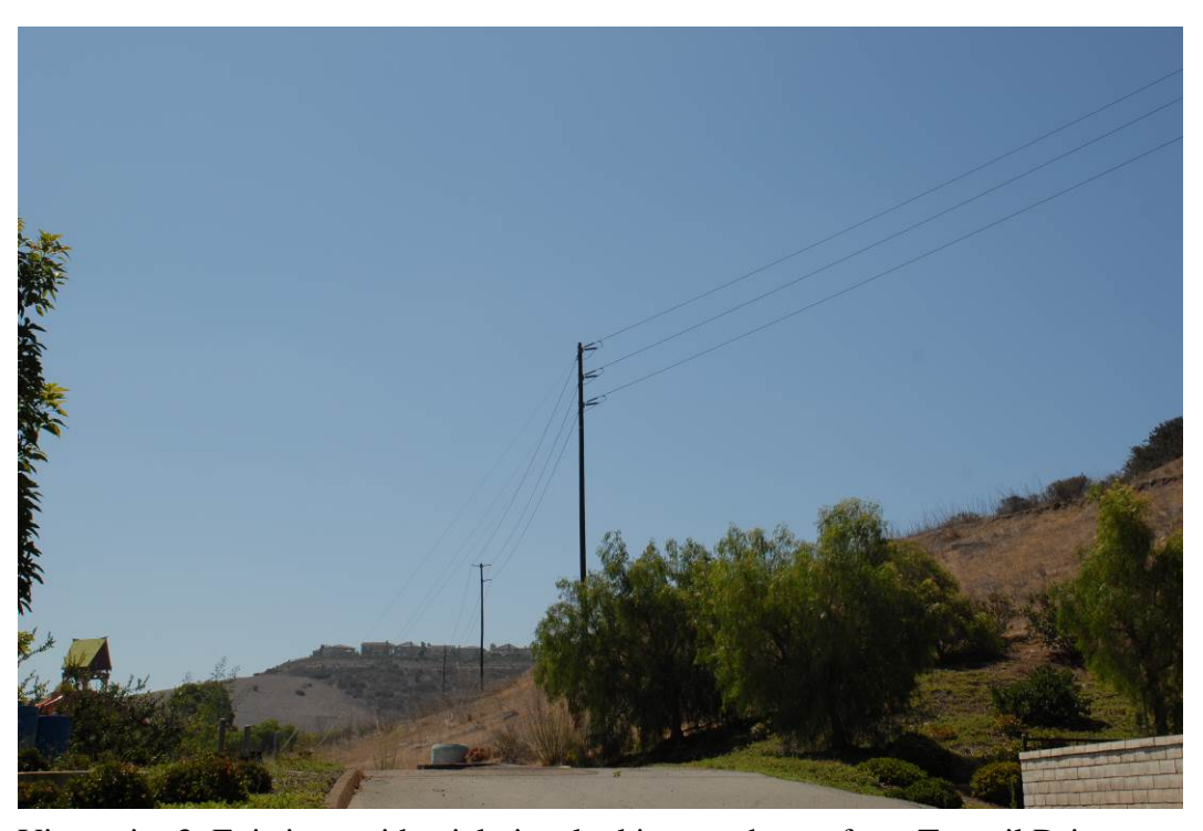
Viewpoint 3: Existing residential view looking southwest from Topsail Drive.