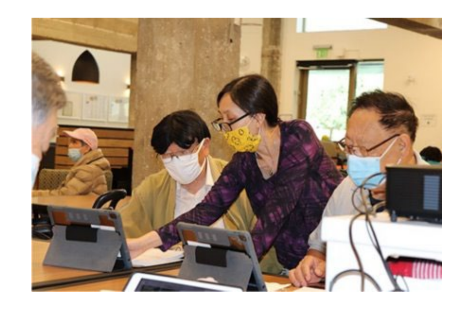
CASF Adoption Account Center for Elders' Independence, digital literacy project grantee

• Grants to build broadband offering free service for low-income communities.