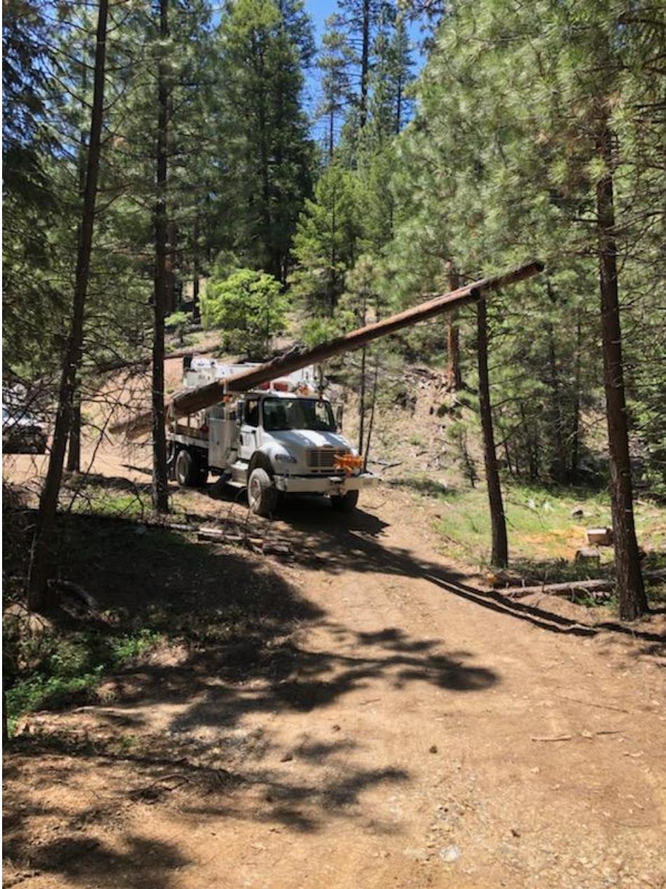
This image illustrates the dense forest and rough terrain of the Mohawk Valley area.