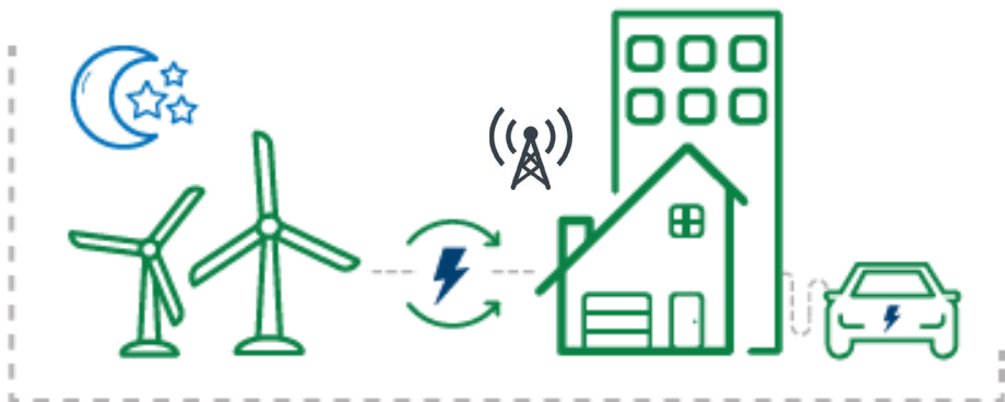
Business as usual night-time flex