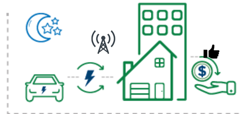
Combined strategy flex