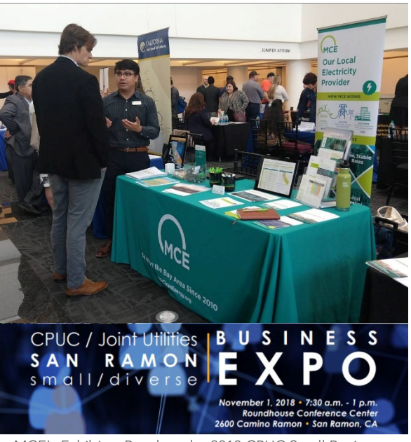
MCE's Exhibitor Booth at the 2018 CPUC Small Business Program Expo