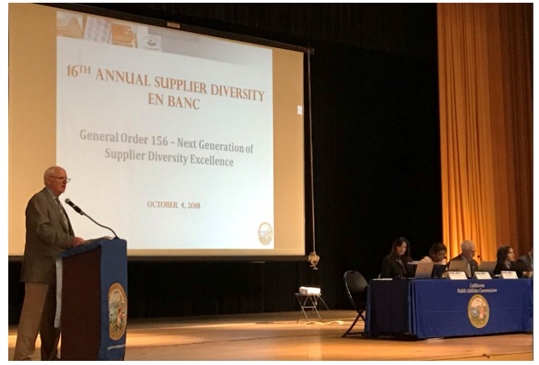
2018 CPUC Supplier Diversity en banc, where MCE staff and Board members spoke on our achievements

In 2018 MCE hosted our own Supplier Diversity Symposium in partnership with The Greenlining Institute and CalCCA in the City of Richmond. MCE's Supplier Diversity Symposium brought together elected officials, CCA suppliers, GO 156 certified businesses, and CPUC commissioners to learn about how CCAs foster diversity in our business practices and through our collective commitment to public-private partnerships in the energy sector.