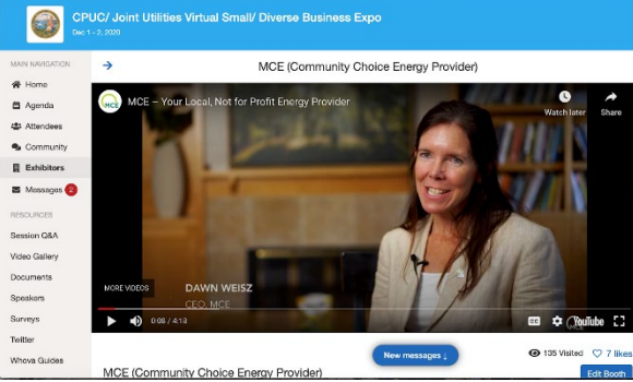
MCE's Whova profile for the 2020 CPUC "Virtual Small/Diverse Business Expo"

MCE's Agricultural and Industrial Resource (AIR) Program offers technical assistance, procurement support, incentives, and ongoing feedback on performance for our agricultural and industrial business customers.