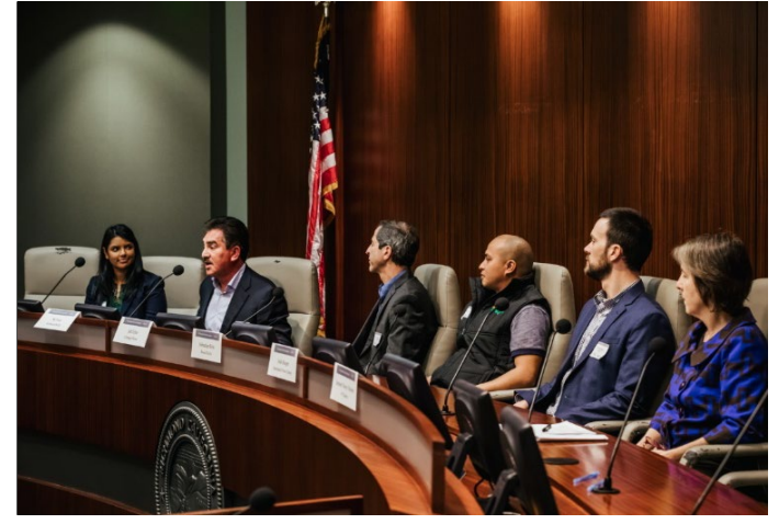
A panel at MCE's 2018 Supplier Diversity Symposium hosted in partnership with The Greenlining Institute.

In 2018, MCE also worked with other community choice agencies to author CalCCA's "<u>Beyond Supplier Diversity Report</u>". The report examined the efforts CCAs were undertaking within the constraints of Proposition 209 and provided the basis for "<u>The Power of Power: Democratizing California's Energy Economy to Align</u> <u>with Environmental Justice Principles through Community Choice Aggregation</u>" (2020).