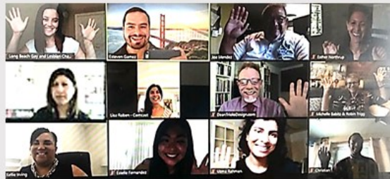
Meet the Buyers Virtual Event

For the 3 rd consecutive year, Southwest Gas partnered with the Long Beach Gay & Lesbian Chamber of Commerce (LBGLCC) for a "Meet the Buyers" event to form connections with small and LGBT businesses. The virtual event featured representatives from various industry sectors sharing Supplier Diversity Program information and details on procurement opportunities.