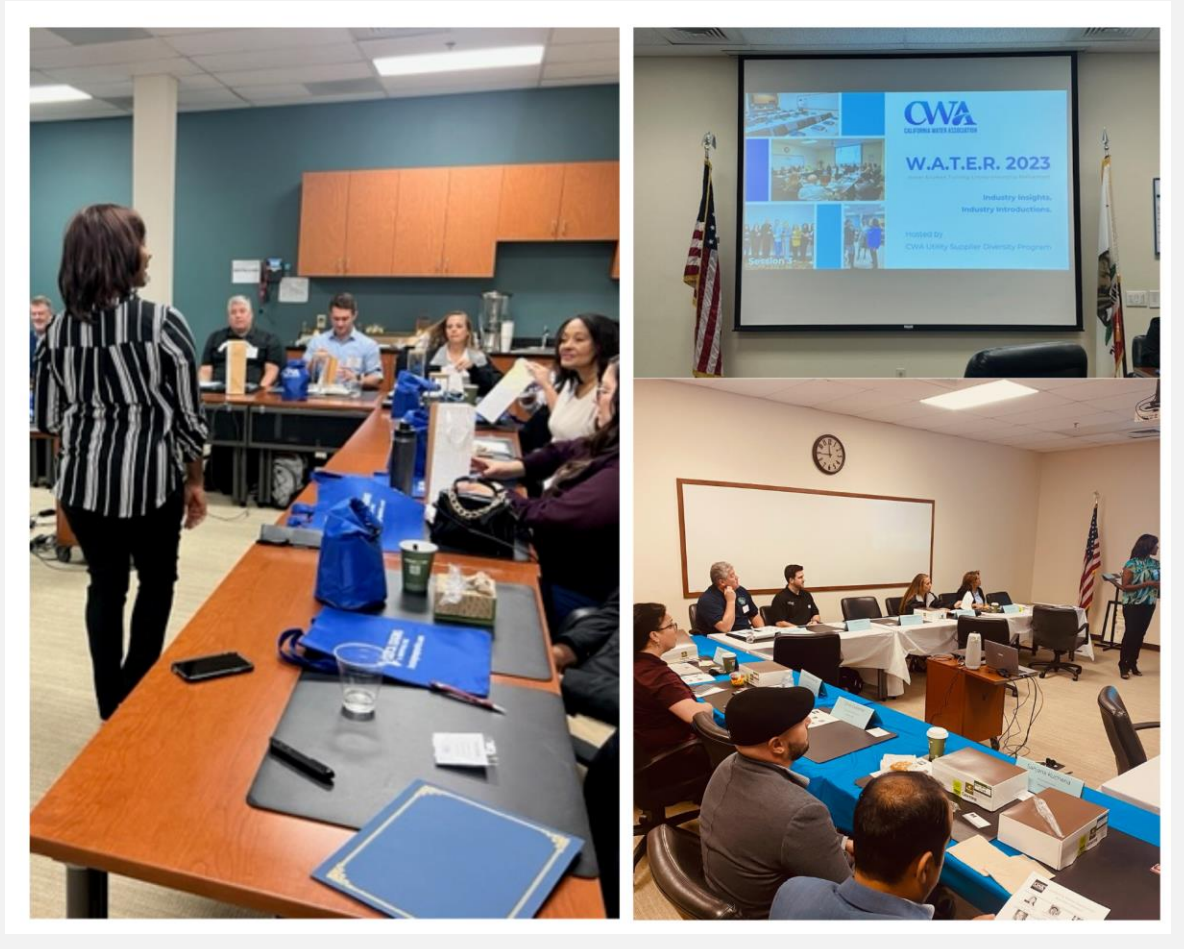
SGVWC UTILITY SUPPLIER DIVERSITY PROGRAM 2023 Annual Report | 2024 Plan

CWA's W.A.T.E.R. 1.0 program continues to be a successful program educating vendors on best practices within the water utility industry.