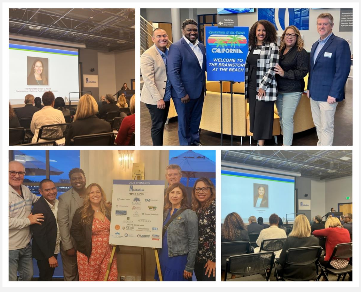
Photos from the National Utilities Diversity Council in Redondo Beach and Downey, CA

In July 2023, San Gabriel USDP representatives attended the American Indian Chamber of Commerce ("AICOC") Annual Expo in Rancho Mirage, California. This conference brings together tribes, tribal enterprises, corporations and native businesses as they gather over a two and half day conference. The AICOC Expo always provides opportunities to connect with Native American Indian owned businesses.