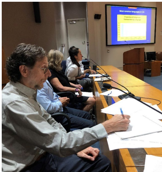
Image 3: Representatives from Community-Based Organizations discuss the need for in-language outreach. September 2019.