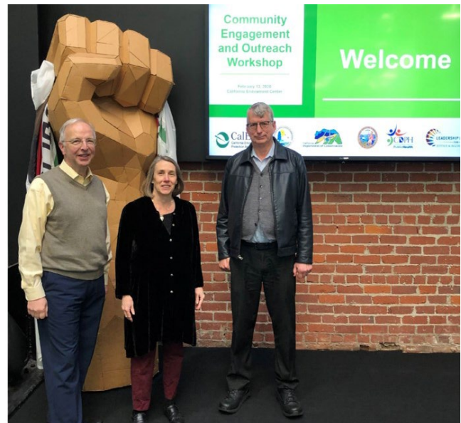
Image 4: CPUC staff attend a Community Engagement and Outreach Workshop in Sacramento. February 2020.