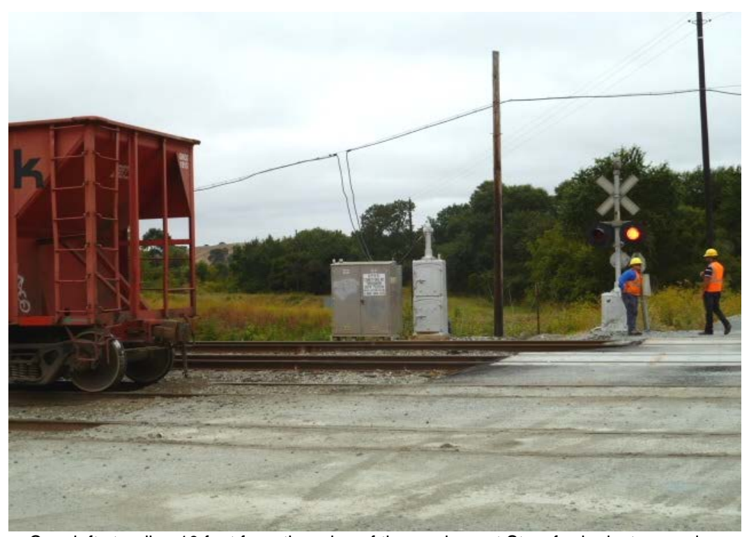
Cars left standing 10 feet from the edge of the roadway at Stonyford private crossing

July 12, 2011: A ROSB Signal & Train Control inspector participated in a focused inspection of the UP Coast Subdivision along with the FRA. The inspection team visited locations between Watsonville and Gilroy. While performing a crossing inspection at Stonyford crossing in Logan, the team noticed rail cars left standing on a track ten feet from the edge of the crossing. This is not in compliance with the General Code of Operating Rules (GCOR) 6.32.4, which requires cars to be left no less than 250 feet from a crossing so as not to obstruct the view for motorists... This also created a hazard by obstructing the view of the crossing from approaching northbound trains on adjacent tracks. Stonyford crossing is equipped with flashers-only warning devices (without warning gates). As a result of the inspection, UP Signal managers immediately notified the UP Dispatcher to apply a stop and protect order on the crossing. This requires trains to stop and have train personnel flag the crossing to protect vehicular and train movements. A Contractor, who was responsible for the rail car placement, was advised that they would need to move the rail cars away from the edge of the crossing to comply with the 250-foot GCOR rule. At the direction of ROSB inspectors, the UP Director of Train Operations scheduled a meeting with Contractor to prevent this unsafe condition from reoccurring again.