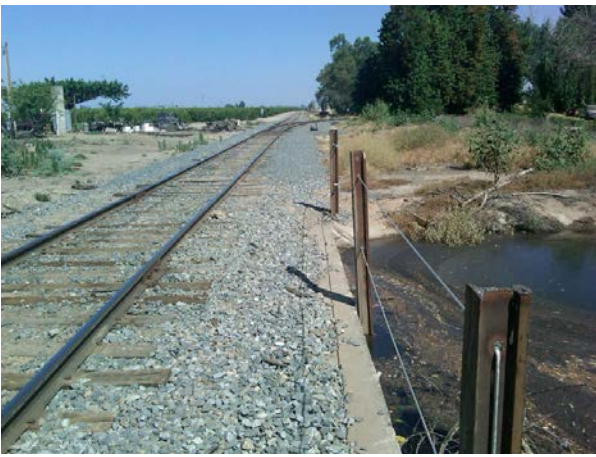
Intial inspection: faulty walkway, no handrails