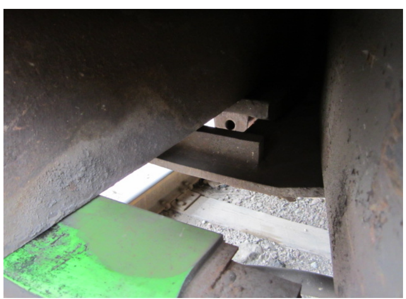
This photo shows the hole where the end of the bolt should be.

June 21, 2012: During an inspection at the BNSF Watson Yard, located in Wilmington, an ROSB inspector identified a broken retaining bolt that supported the large vertical pin located at one end of a rail car. This pin secures the car in place. Left uncorrected, this condition could have caused the rail car to separate from the rest of the train. The inspector recommended a civil penalty for this defect..