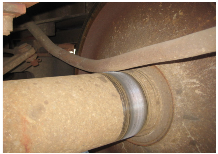
Defective axle on UP train declared ready for departure

March 19, 2012: A ROSB inspector conducted an inspection of the UP/Richmond Pacific Railroad interchange track in Richmond. During the inspection the inspector identified six hazardous material cars without properly applied hand brakes. This condition is out of compliance with federal regulations pertaining to securing cars or engines. Unapplied, or improperly applied, hand brakes could allow rail cars to roll out of the track and become runaways. Further investigation revealed that a Richmond Pacific Railroad switch crew had left the cars unsecured on the interchange track and had gone to another rail yard to pick up additional cars. The cars were unsecured on a track that is connected to a UP Main Line track, where passenger trains travel regularly. Due to the potential danger to public safety that this situation posed, the railroad was immediately notified; protective and preventive actions taken. Railroad personnel arrived and applied the appropriate number of hand brakes. Subsequently, the ROSB inspector issued an FRA civil penalty recommendation (Violation).