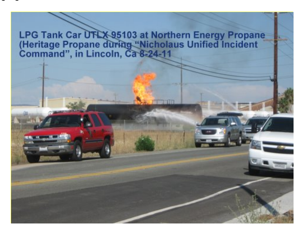
LPG Rail Tank Car loaded with liquefied petroleum gas being cooled by water. Up to 5,000 gallons a minute of water were used by the firefighters to keep the tank car cool to control the burn

The investigation revealed that the incident was caused by operator error. Static friction can occur when propane flows when a tank car is not adequately grounded. An employee of the facility was sampling product without sufficient grounding protection, which caused the product to ignite. ROSB recommendations included reviewing and altering procedures for unloading LPG cars, including placing cars in a location where they can be grounded before opening any valves. UPRR confirmed to the ROSB that these recommendations have been put into place so as to prevent this type of incident happening again.