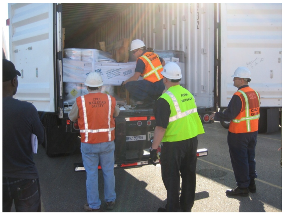
Team inspects container with inadequate safeguards

tip over, become damaged and ultimately leak. As a result of this inspection, the shipping of these containers was not permitted until the defects were corrected.