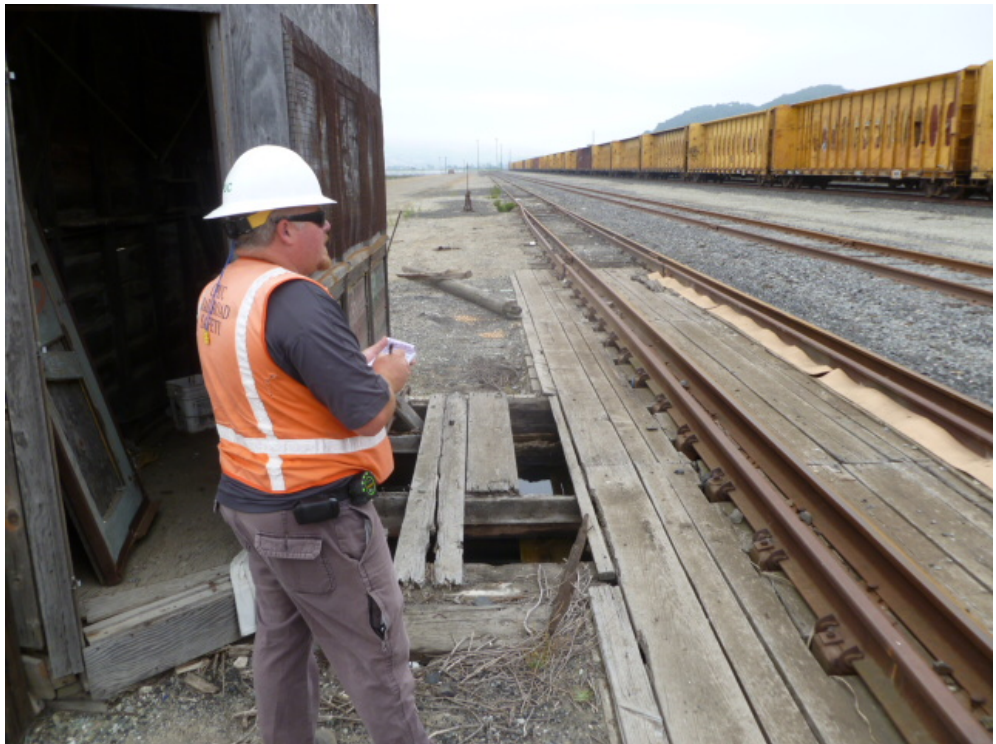
Hazardous walkway condition at UPRR's Watsonville Yard

August 8, 2011 : During an inspection a ROSB track inspector discovered several walkway hazards while inspecting track on the UP Coast Subdivision track in the Watsonville Yard. There were broken wood walkway planks (with water below) and a power pole left in a walkway, which rendered the walkway out of compliance with Commission General Order 118-A (118-A regulates walkway safety). These conditions presented a serious slip, trip, or fall hazard to trainmen who work in this area, especially at night. The inspector reported the defect to railroad management. The condition was promptly corrected.