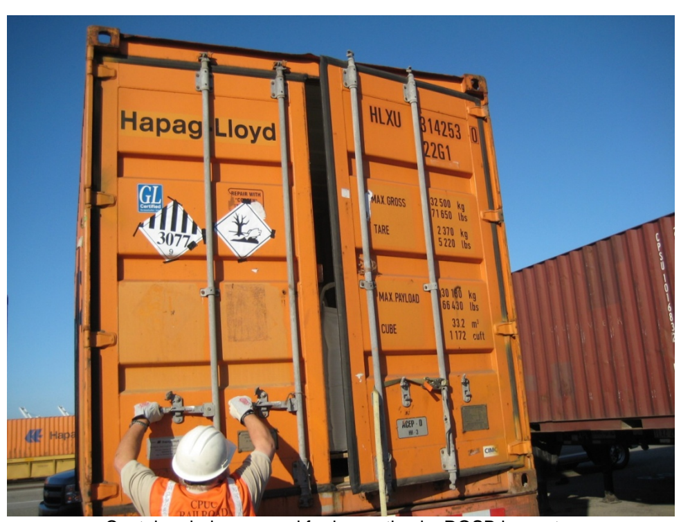
Container being opened for inspection by ROSB inspector

October 18 & 19, 2011: During an ROSB inspection, three Operating Practices (OP) inspectors and a Signal & Train Control (S&TC) inspector visited Stockton to conduct the second in a series of Northern California OP focused inspections. They inspected