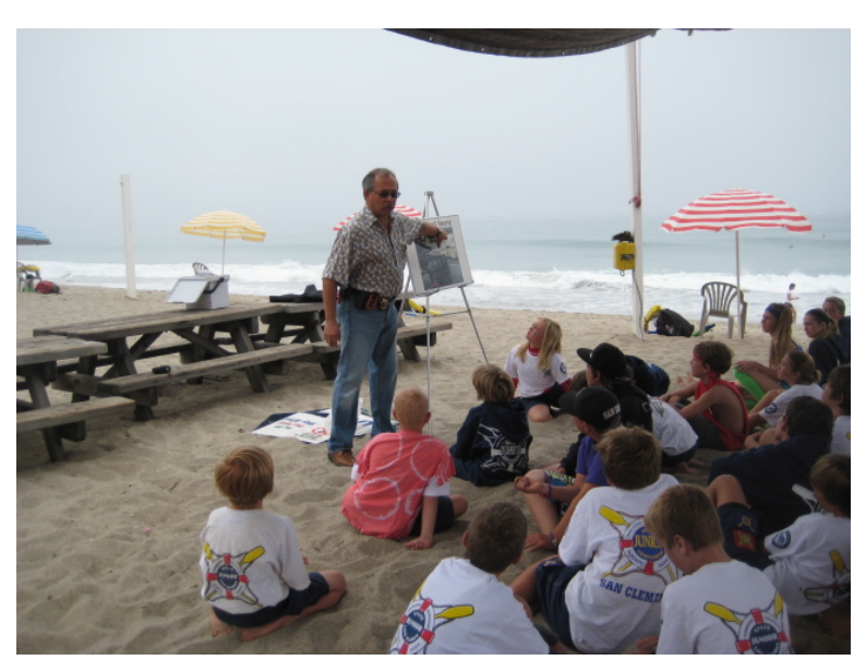
Inspector delivers OL presentation to San Clemente Jr. Lifeguards

July 13, 2011 : An ROSB inspector gave an Operation Lifesaver (OL) presentation to a group of Junior Lifeguards at the State Beach in San Clemente. This is a prime location for OL training as trains, such as Metrolink, travel adjacent to this very popular beach. The presenter was pleased to hear from previous participants remembered safety pointers such as STAY OFF THE TRACKS, STAY AWAY AND STAY ALIVE . The audience was provided information, such as train stopping distances, and warned that once a train engineer sees someone on the tracks it is too late for the train to stop before hitting the person. The inspector is invited to return to speak to additional groups of Lifeguards to spread the OL safety message in an ongoing effort to raise public awareness about tracks and trains.