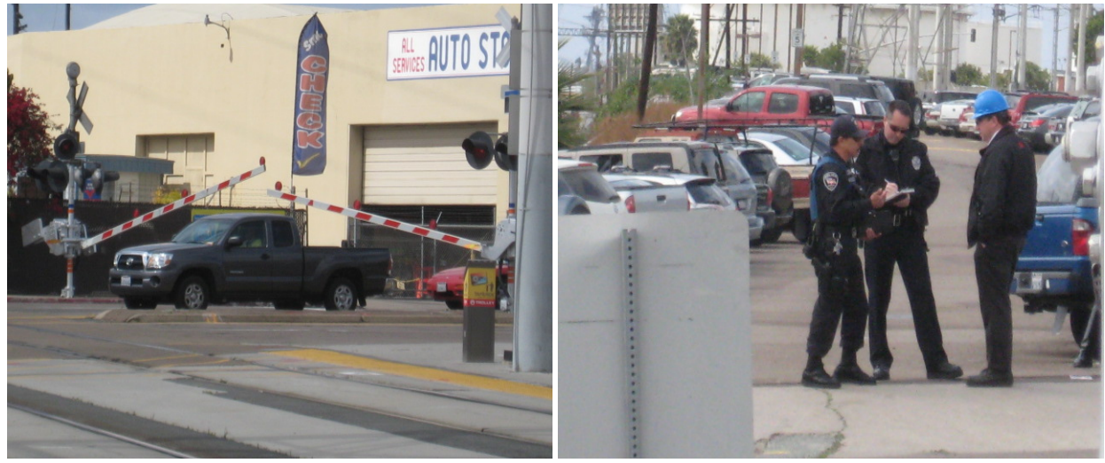
A passenger vehicle proceeding under crossing gates, and a pedestrian receiving a citation

February 27, 2012: The San Diego Police Department conducted a railroad safety regulation enforcement event at the railroad grade crossing located at South 28th Street and East Harbor Drive in southeast San Diego. ROSB participated by assisting at an OL booth set up in the same area to educate pedestrians about trains and railroad tracks, sharing with them safety tips to help prevent injuries or fatalities. The location of 28th street and E. Harbor Drive was selected due to several safety concerns: (1) BNSF railroad tracks and San Diego Trolley tracks being in close proximity to each other, giving rise to the strong possibility of trains approaching from different directions, (2) heavy vehicular and pedestrian traffic in the area, (3) tracks separated by a gap inside of which vehicles could get caught, raising the possibility of such vehicles fouling the track while a train is approaching, and (4) BNSF train crew reports of close calls of near-collisions of pedestrians and vehicles with BNSF trains. During this five hour event, police issued citations to 60 motorists and 10 pedestrians, 18 warnings were issued to drivers, and 1 car was impounded. Approximately 25 pedestrians were educated at the OL safety booth staffed by ROSB.