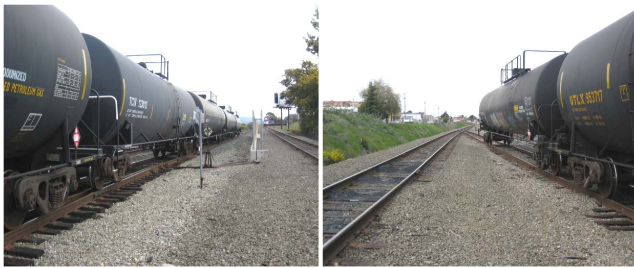
Cars left unattended without proper hand brakes

March 19, 2012: A ROSB inspector conducted an inspection of the UP/Richmond Pacific Railroad interchange track in Richmond. During the inspection the inspector identified six hazardous material cars without properly applied hand brakes. This condition is out of compliance with federal regulations pertaining to securing cars or engines. Unapplied, or improperly applied, hand brakes could allow rail cars to roll out of the track and become runaways. Further investigation revealed that a Richmond Pacific Railroad switch crew had left the cars unsecured on the interchange track and had gone to another rail yard to pick up additional cars. The cars were unsecured on a track that is connected to a UP Main Line track, where passenger trains travel regularly. Due to the potential danger to public safety that this situation posed, the railroad was immediately notified; protective and preventive actions taken. Railroad personnel arrived and applied the appropriate number of hand brakes. Subsequently, the ROSB inspector issued an FRA civil penalty recommendation (Violation).