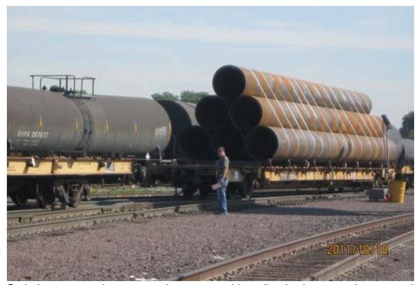
Switchman too close to equipment, and handbrake improperly secured

BNSF Railway's Mariposa Intermodal Yard, BNSF Riverbank and Mormon Yards as well as UP and Central California Traction (CCT) yard facilities in Stockton. OP inspectors observed switching & yard conditions, walkway conditions and compliance with federal and state regulations; and railroad operating and safety rules. The inspection team found that the Stockton UP Yard had a number of defects and violations, which consisted of equipment left on an adjacent track and failure to properly secure rail cars from unplanned movement. These findings were reported to the appropriate UP managers (and Superintendent) in Stockton. The conditions were promptly corrected.