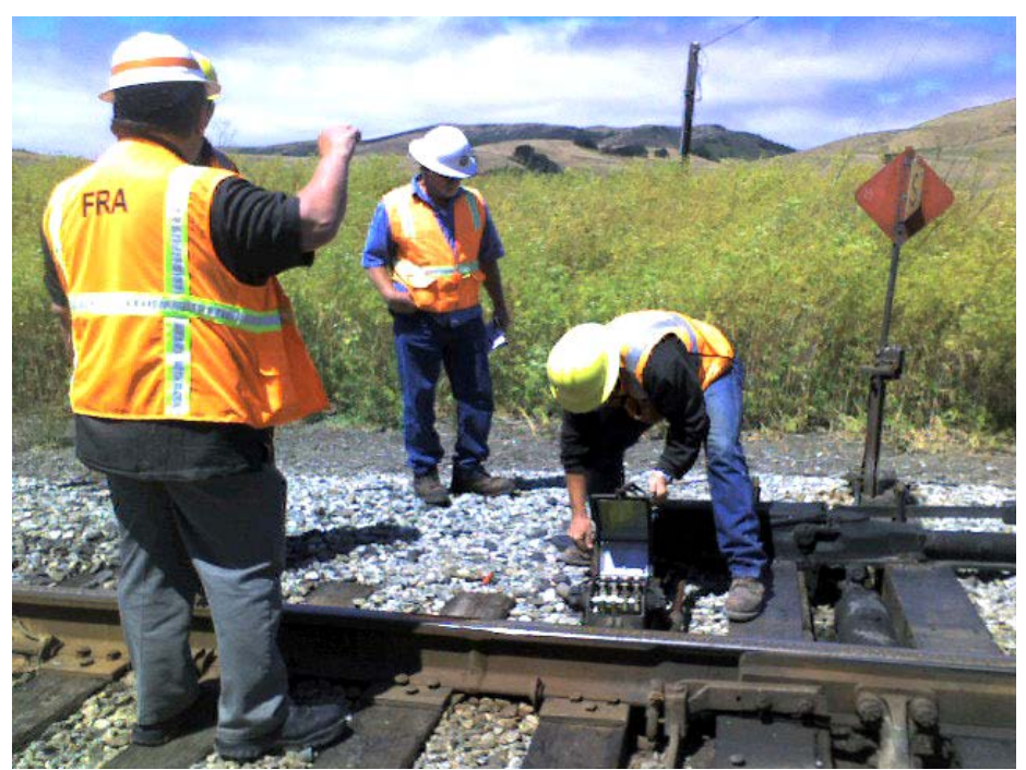
FRA and ROSB inspectors observe a UPRR inspector performing a test on a spring switch to verify that it is properly working to activate a red signal warning oncoming trains. Without this signal warning a full speed derailment could occur.

July 12, 2011: A ROSB four-person Hazardous Materials inspection team participated in a focused inspection, along with the FRA, at the Port of Long Beach. Members of the United States Coast Guard (USCG) also assisted in the inspection. Port of Long Beach operations include loading and unloading of various commodities, which include hazardous materials and preparation of them for continued transportation by rail. Teams were established containing a member from each agency and assigned a specific shipping company to inspect. At the completion of the inspection, an overall After Action Review was conducted by the FRA. The review concluded that 275 containers were inspected with an estimated ten percent of them having minor defects, and one container having a federal violation pertaining to the shipping of hazardous materials. As a result of the inspection, the defects were corrected by the shipping companies.