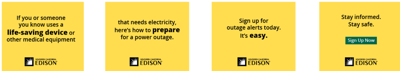
Above: Digital banner ads for Medical Baseline customers, launched January 2021