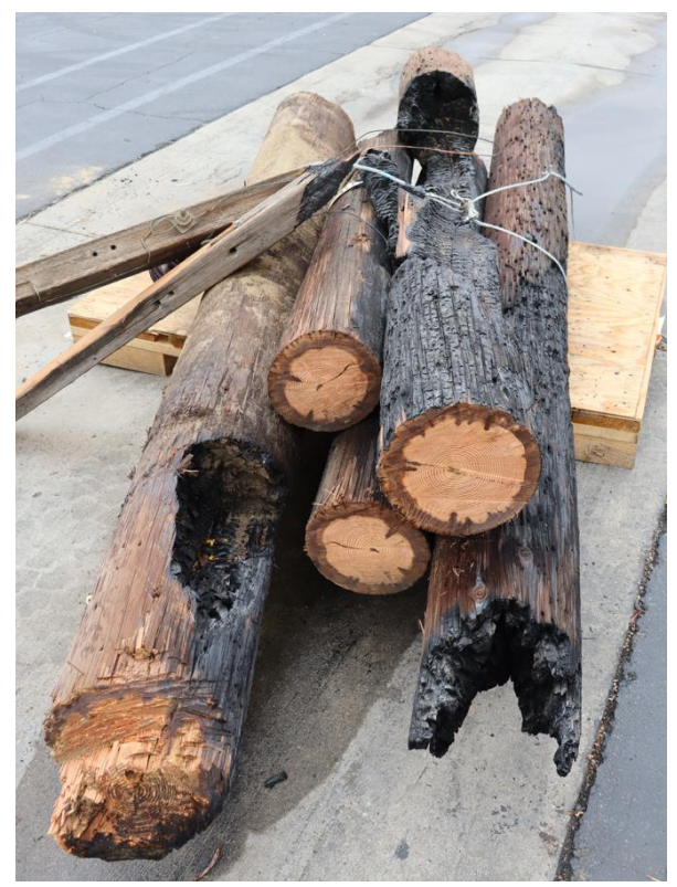
Figure 6: Pole No. 1714303E cut into sections for transportation and stored at the SCE yard.