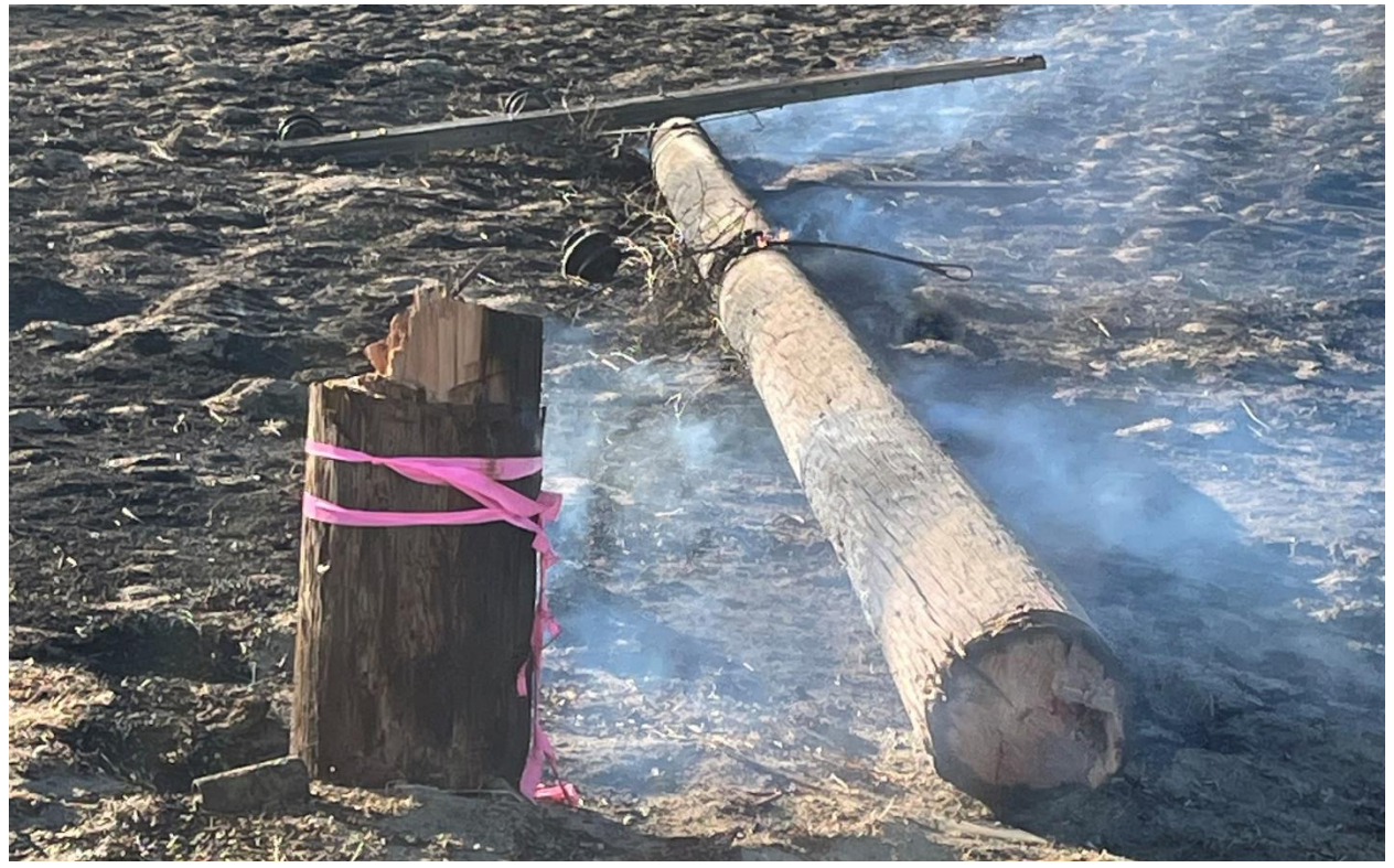
Figure 3: Pole No. 1714303E downed at Incident Location on November 9, 2023.