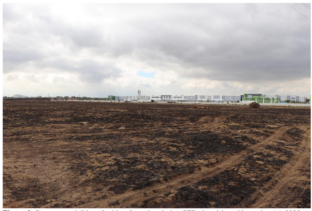
Figure 2: Burn scars visible at Incident Location during SED site visit on November 16, 2023.