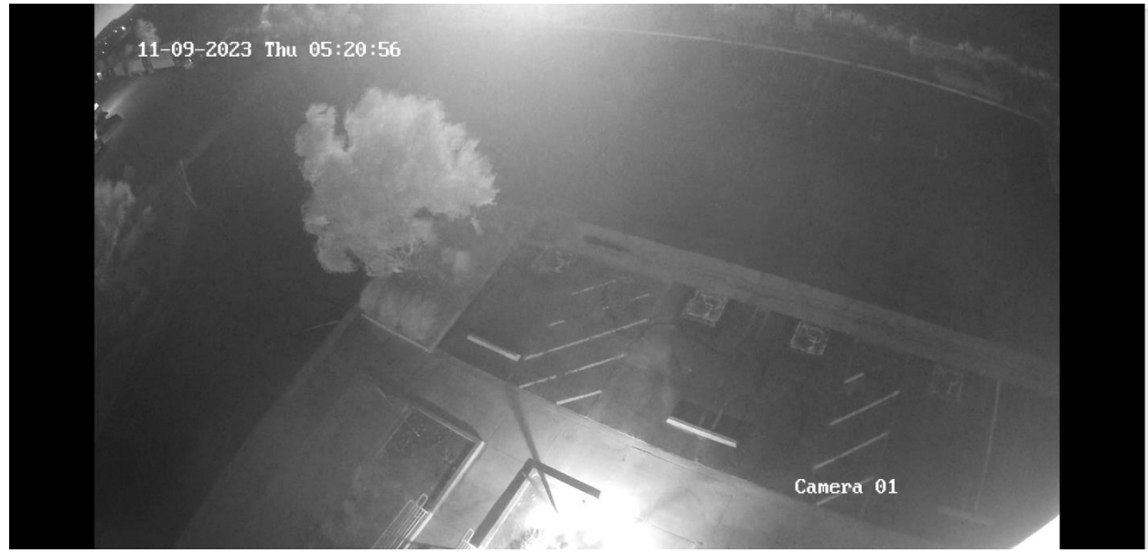
Figure 9: Security footage showing parking lot after ignition and power being lost to streetlight.

On December 12, 2023, SED received the 20-Day Report from SCE. WSEB reviewed the 20-Day Report and determined that a data request would not be needed, due to the evidence indicating that the pole was most likely vandalized. CAL FIRE also determined that the pole had