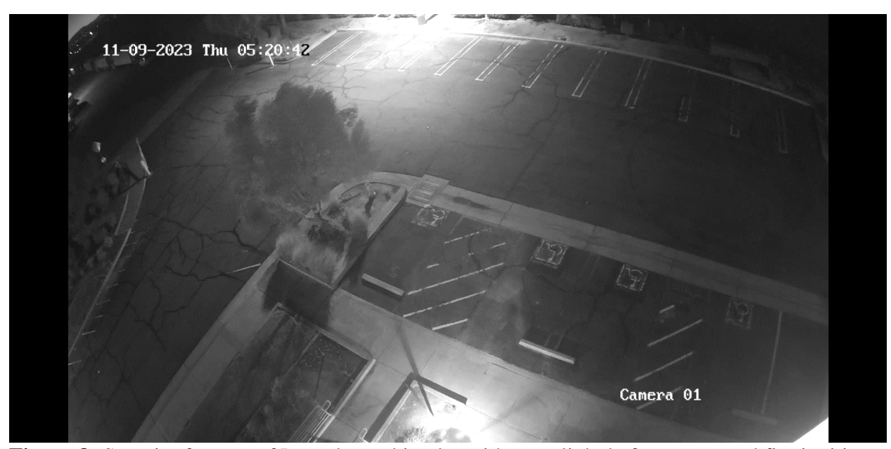
Figure 8: Security footage of Levecke parking lot with streetlight before suspected fire ignition.

On December 1, 2023, SED received security footage from a nearby business, which SCE Senior Advisor Jose Moran had recommended SED contact. SED investigators reviewed the security footage and were not able to conclusively determine if an individual vandalized Pole No. 1714303E, due to the angle of the camera not showing the field adjacent to Landon Drive. SED concluded that the pole was downed around approximately 0520 hours due to observing three flashes on the security footage followed by power going out to nearby streetlights.