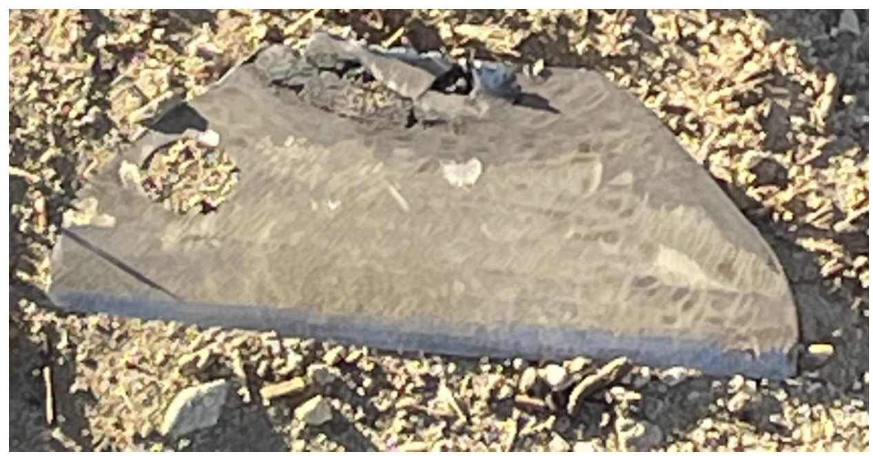
Figure 5: Blade-like object photographed by SCE personnel on November 9, 2023, next to the fallen pole.

SED then traveled to the SCE Service Center located at 7951 Redwood Avenue in Fontana, California. SCE escorted SED to the yard and viewed the damaged pole. SCE had cut the damaged pole for easier transportation from the Incident Location, but the cuts made for transportation were cleanly cut and evident. SED investigators were able to observe the portion of the pole that had been most likely cut by the blade-like object photographed at the Incident Location. The damaged portion of the pole was clearly distinct from the cuts made for transportation because the pole was not cut cleanly through. This damaged portion of the pole was approximately 30 inches above ground level, as measured by SED.