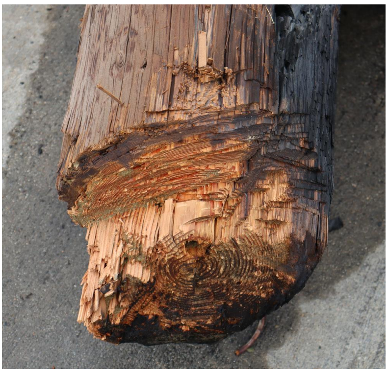
Figure 7: Bottom half of Pole No. 1714303E showing where the pole was most likely cut by the blade-like object.