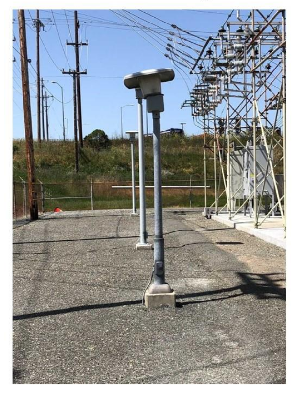
Franklin01: Broken light