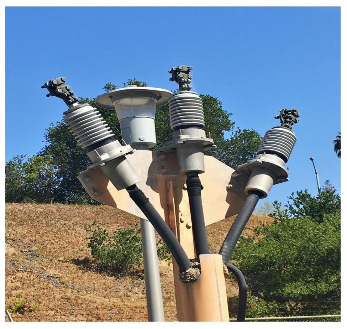
Figure 8: TD-3322M Subsection V.A.6 Finding

ValleyView04: An underground cable that is not in use is not grounded