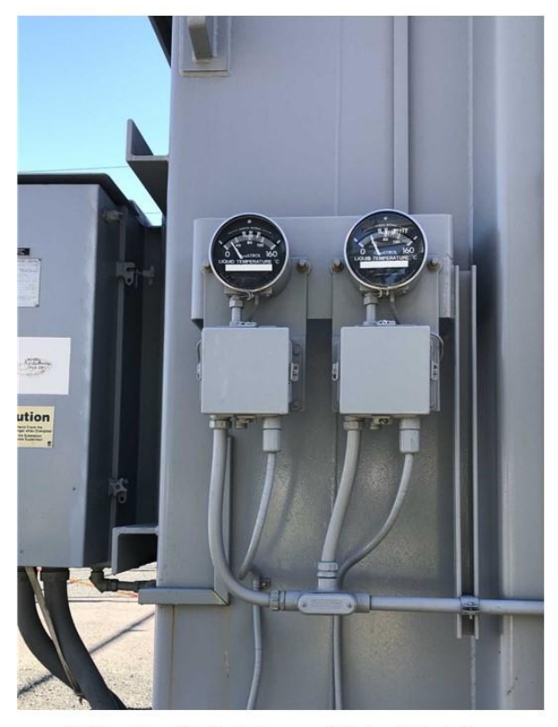
WillowPass02 Faded gauge labels at Bank 3