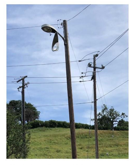
Clayton02: Hanging light cove