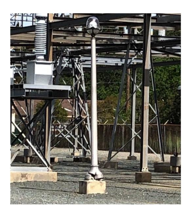
Clayton03: Damaged light pole foundation