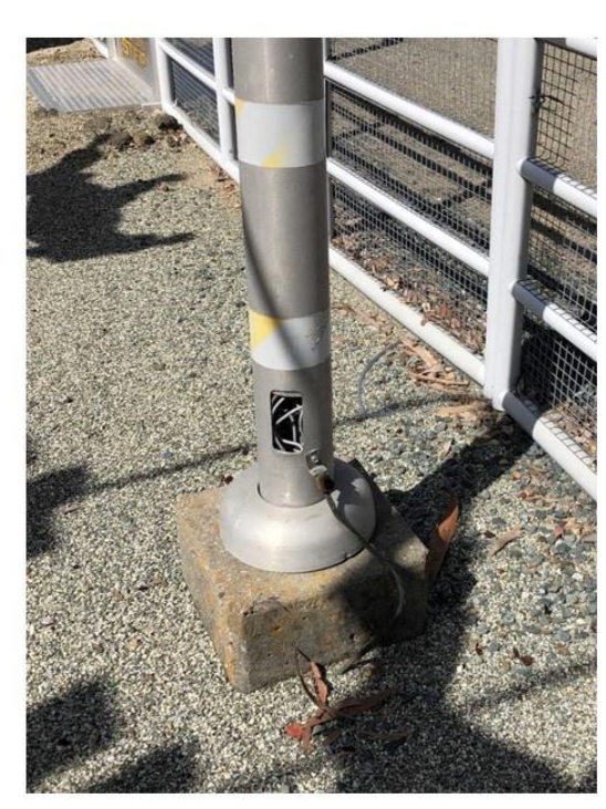
ValleyView01: Missing cover on light pole foundation