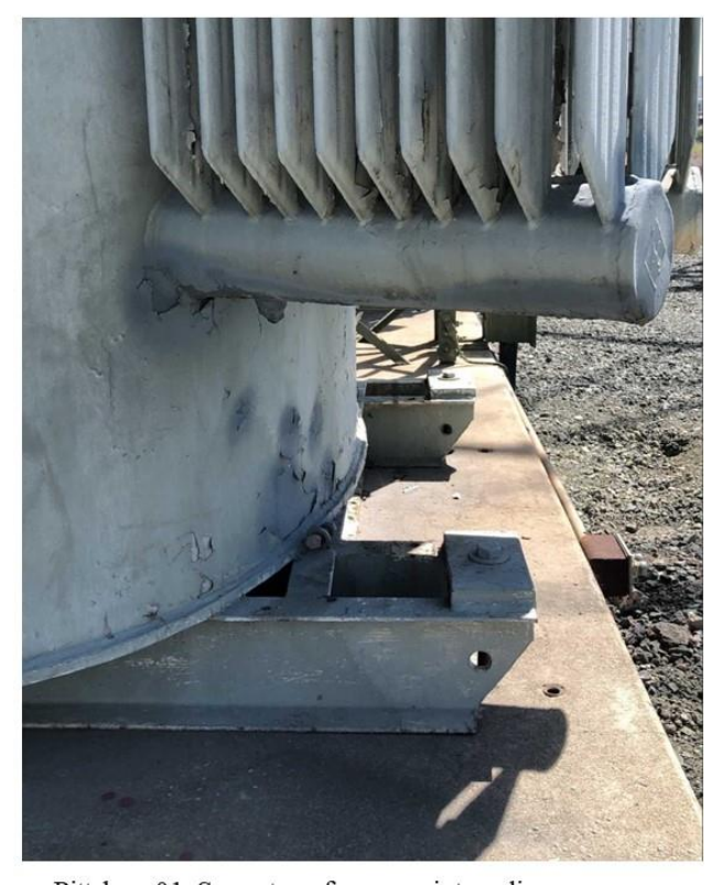
Pittsburg01 Spare transformer paint peeling