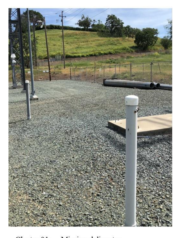
Clayton01: Missing delineator