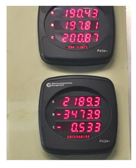
Figure 9: Inadequate Power Factors