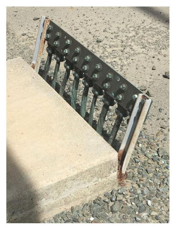
Pittsburg02: Tripping hazard