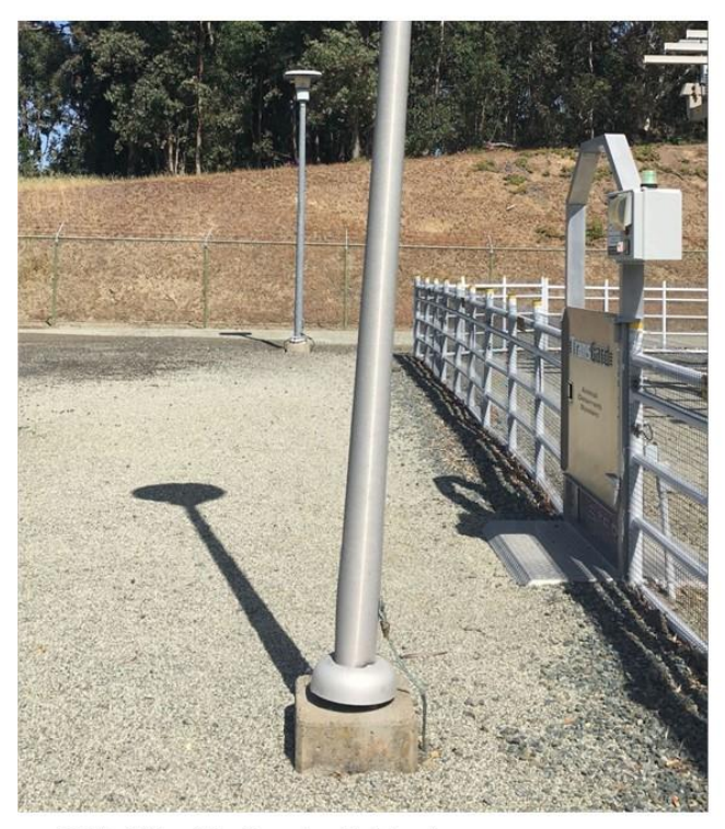
ValleyView02: Leaning light pole