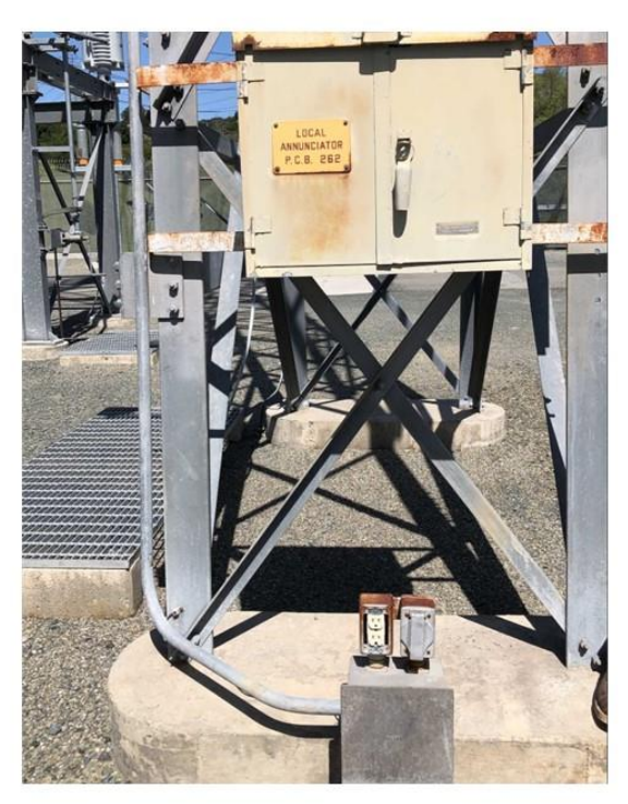
Sobrante02: Abandoned annunciator