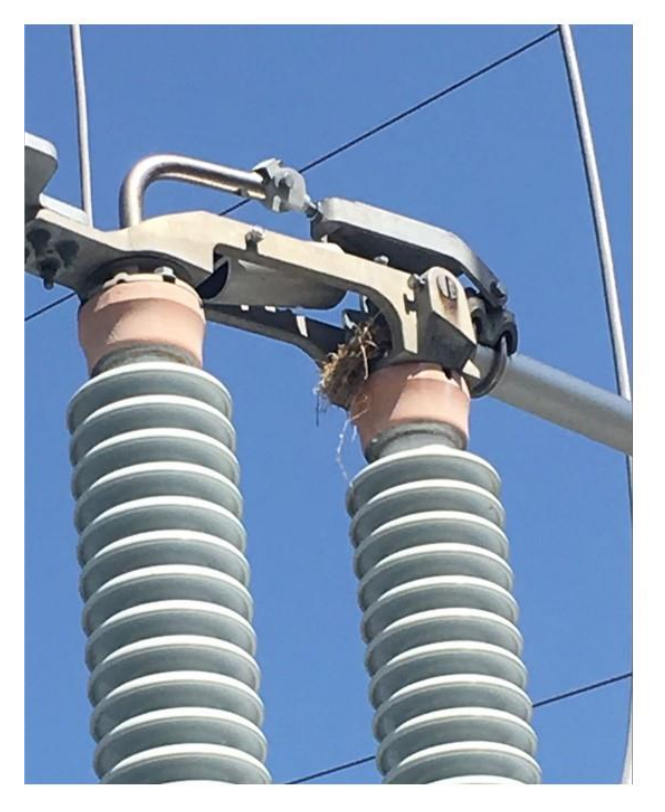
Christie01: A bird's nest at Switch 1215