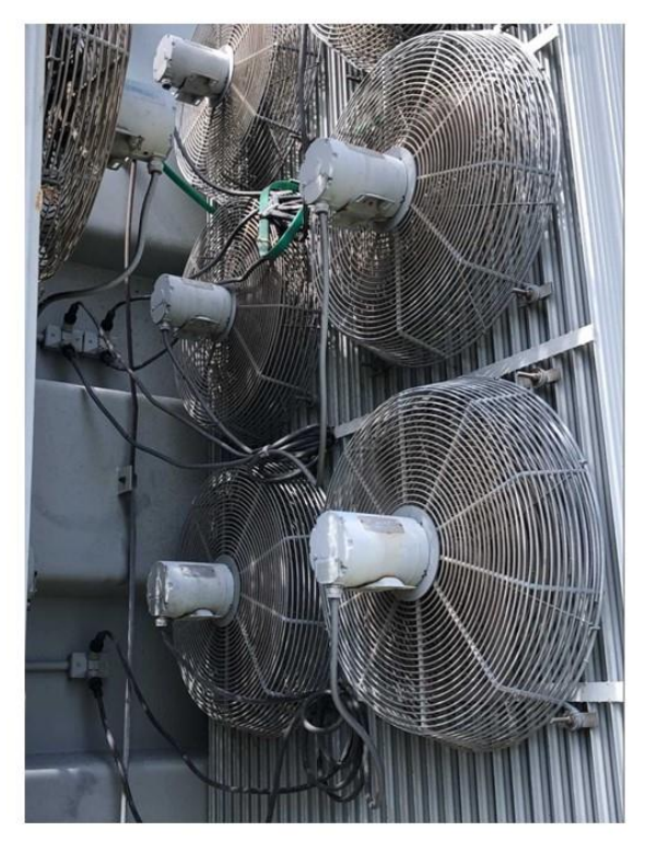
Clayton04: Abandoned cooling water hose at the transformer bank cooling fans