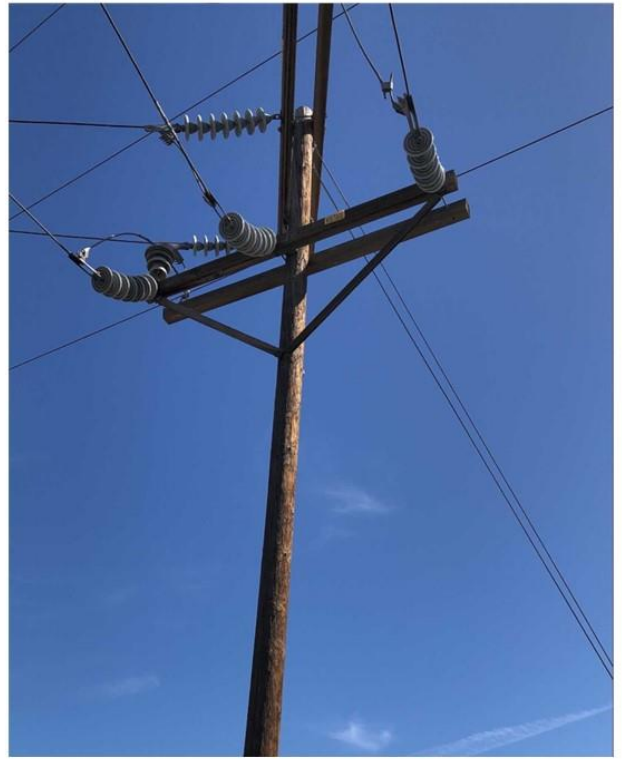
WillowPass04: The "High" is missing in the "High Voltage" sign