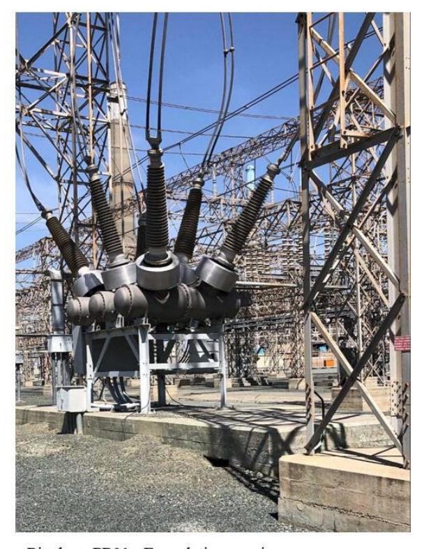
PittsburgPP01: Foundation erosion