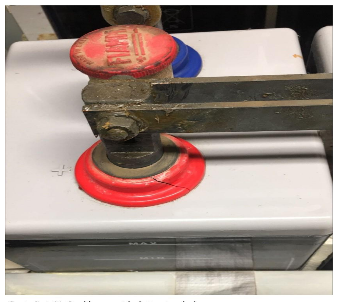
Figure 5: TD-3322M Substation Batteries Subsection II.D.1 Finding

ContraCosta01: Cracking cap at the battery terminals