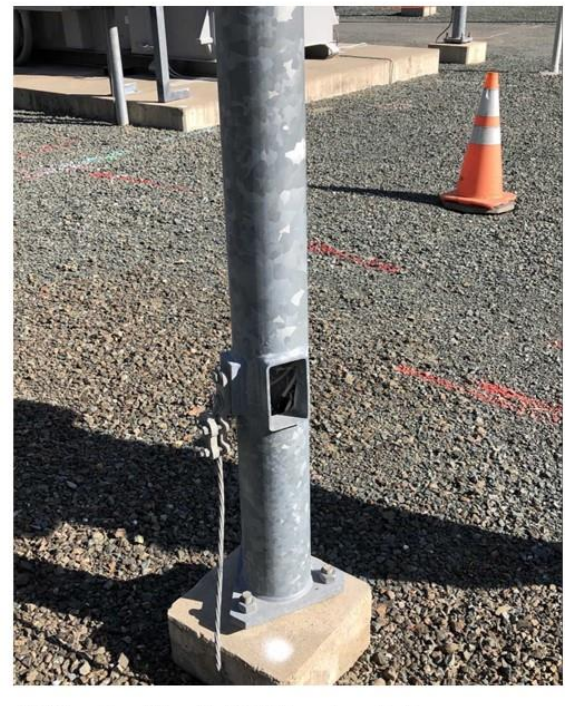
WillowPass01: At 21 kV yard - missing cover on light pole foundation