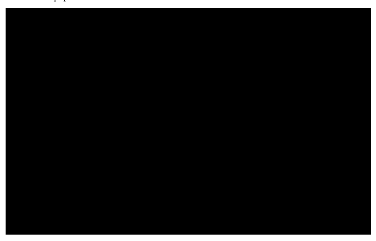
Figure 4: Missing equipment labels on the GT-1 (left) and GT-2 (right) grounding transformers.

The equipment labels for grounding transformers GT-1 and GT-2 in the Montezuma I substation are illegible. Proper equipment labelling is essential to ensure personnel are operating or servicing the correct equipment.