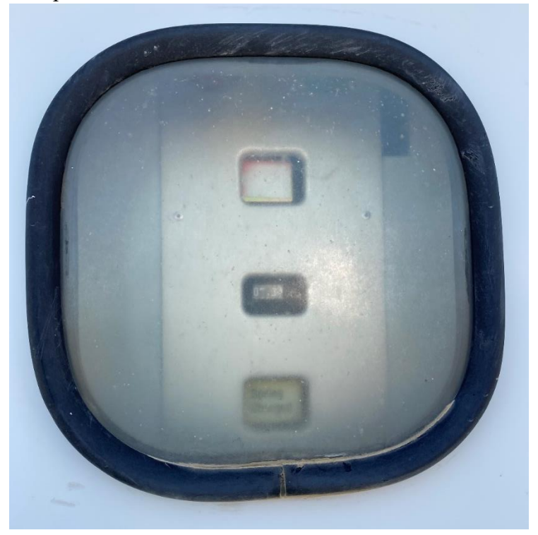
<u>Figure 7</u>: Illegible counter (middle) and faded breaker position indicator (top).

The counter that counts the number of breaker operations on Feeder Breaker 52-F2 is illegible. Additionally, the breaker position indicator on the top of the panel is faded, which makes confirming the breaker's position difficult.