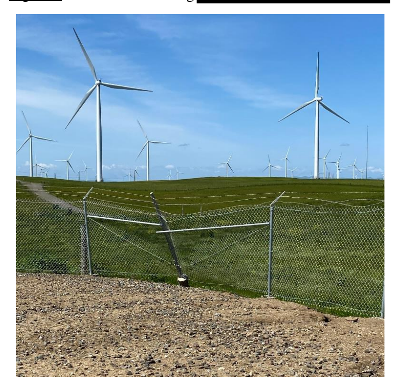
Figure 2: Damaged and washed out fencing