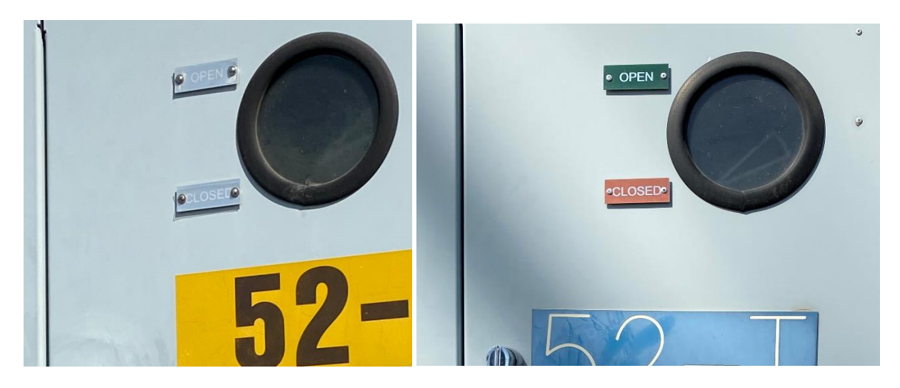
<u>Figure 3</u>: Faded "OPEN" and "CLOSED breaker labels (left), compared to another breaker's labels in the Montezuma I substation (right).

The high voltage SF6 breaker position labels in the substation were discolored. The "OPEN" and "CLOSED" labels on the other SF6 breaker in the Montezuma I substation yard were colored green and red, respectively. Having the breaker positions colored and labeled ensures immediate positive verification of the breaker's physical position without needing to open the breaker cabinet.