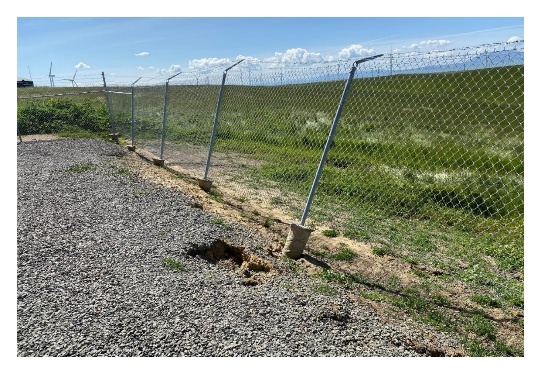
Figure 1: Washed out fencing