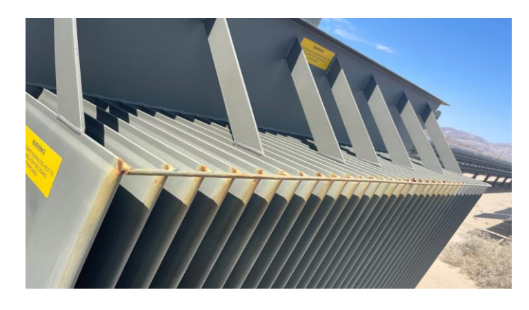
Figure 18: Rust on Inverter B12-07 Transformer.

ESRB observed atmospheric corrosion on multiple pad-mounted transformers specifically on radiators and their oil pipes. Plant-wide inspection and examination are recommended to identify corroded transformers and develop action plans to prevent further progress on the high voltage critical equipment.