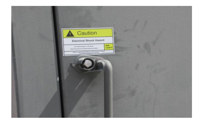
Figure 13: 18-PVCS Switch Cabinet