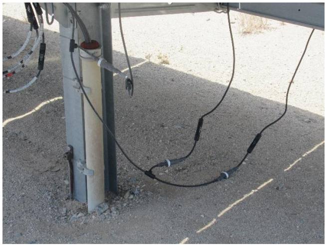
Figure 10 & 11: Loose cables touching the ground in Blocks 1 and 3 arrays.