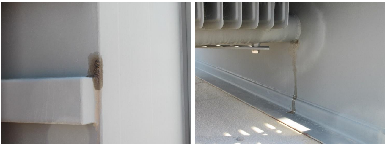
Figure 3 & 4: Pinhole Oil Leaks from Transformers next to Inverter B8-09 and B18-06.

ESRB staff observed oil leaks on the transformers next to Inverter B8-09 and B18-06. Staff also observed oil leaks in the substation from GSU1 at the radiator valve and flange, as well as GSU2 near the bottom of the transformer and from the LTC drain valve. The plant must investigate the leakage to identify causes and evaluate any possible operational and structural anomaly of equipment for corrective actions ensuring safety and reliability of the critical assets and personnel.