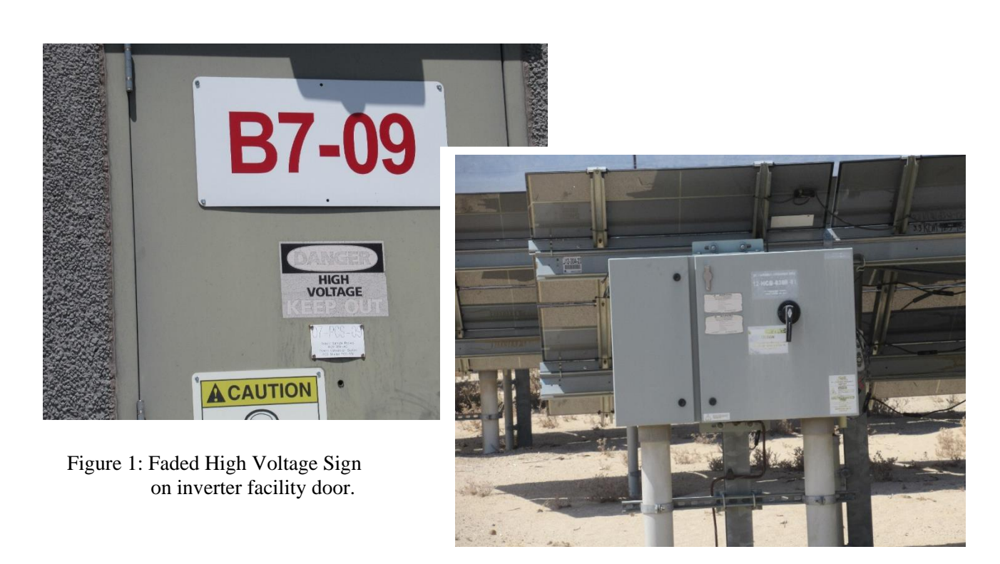
Figure 2: Faded signs/labels on the combiner boxes

ESRB staff observed faded High Voltage signs on the inverter facilities. ESRB staff also observed faded Arc Flash stickers and identification stickers on the combiner boxes. These ID signs are important for the quick identification of equipment, and they help hasten repairs or maintenance being completed. The safety signs help inform employees, contractors, and visitors who may be unfamiliar with the equipment and its inherent dangers. All eligible signs must be replaced to display pertinent hazard information complying with NFPA-70 E and relevant OSHA regulations.