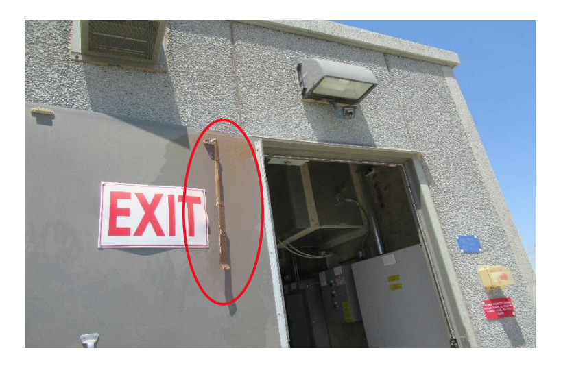
Figure 15: Inverter B10 02. The door auto closing mechanism was broken. This may have inverters exposed to dust, vermin and rainwater and result in the system failure and damage.

ESRB staff observed several damaged items around the plant. The plant management must establish comprehensive inspection programs to identify damage, malfunction on the balance of plant and verify execution of routine maintenance activities to eliminate unnoticed latent problems and equipment failure.