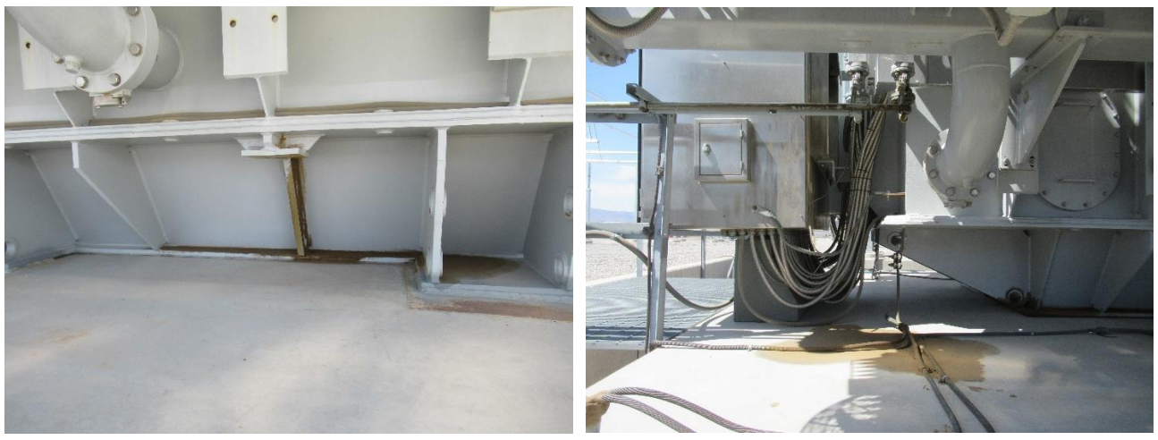
Figure 7 & 8: Oils Leaks on Transformer GSU2 in substation.