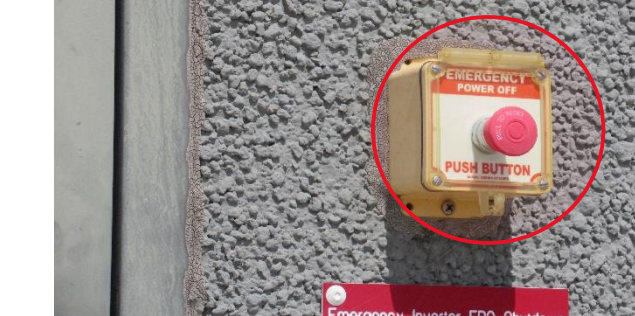
Figure 16: Inverter B12 07. Emergency Shut-off Button cover was missing. This may cause inadvertent system shutdown and damage.