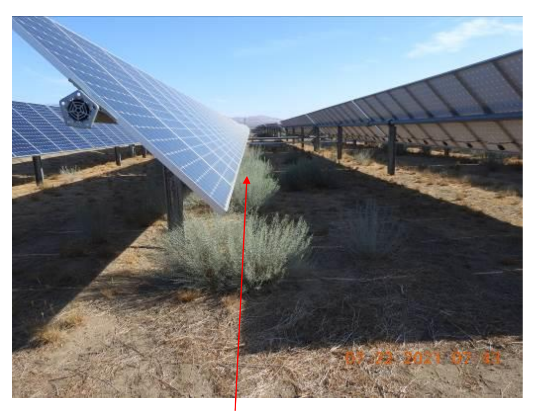
Vegetation near solar panel

ESRB staff observed vegetation near one of the solar panels which is a fire threat hazard.