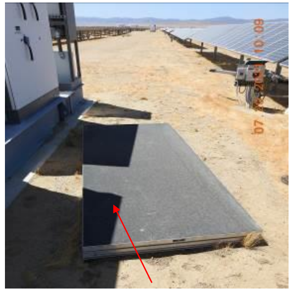
A ladder on the ground