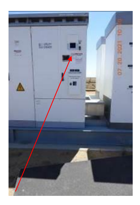
Deteriorated Warning Sign