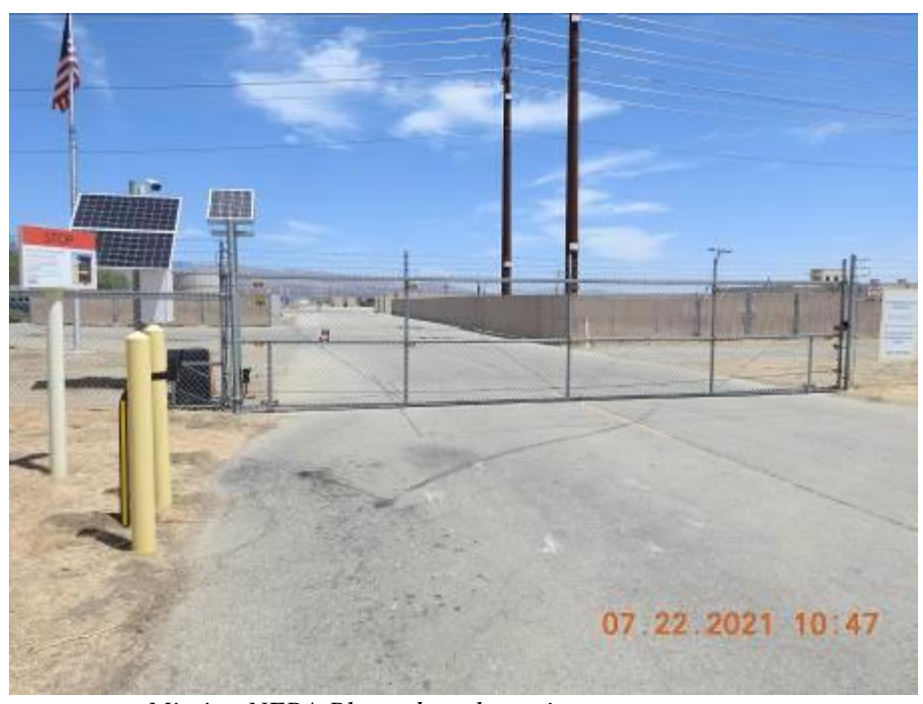
Missing NFPA Placard on the main gate.

ESRB observed that the Plant's main gate did not have a National Fire Protection Association (NFPA) 704 warning placard. The Plant stockpiles and uses hazardous chemicals as part of its normal operation. NFPA 704 is a standard system for identifying hazards of materials for emergency response. The posting of an NFPA placard on the main gate is a common industry practice so first responders can quickly and easily identify the risks posed by a facility's hazardous materials. This helps emergency personnel to determine what safety gear and precautions to use and how best to respond in emergencies.