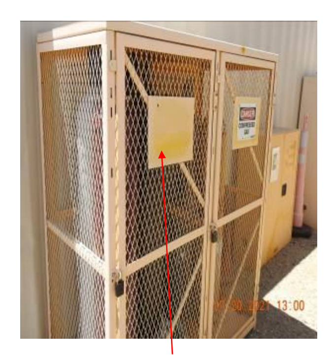
No NFPA Sign and doors were not equipped with the self-latching device.