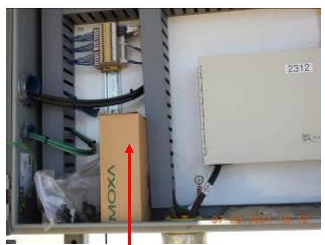
paper boxes inside the cabinet