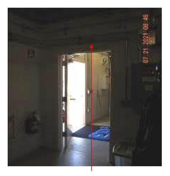
No Exit sign