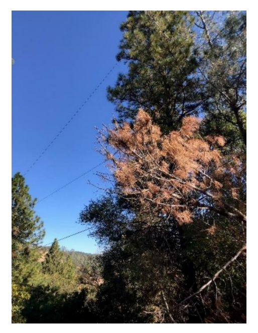
Figure 1 – Tree Fall Near 10 Mayberry Rd, Oroville

Figure 2 – Vegetation Debris Near 98 Gamble Rd, Oroville