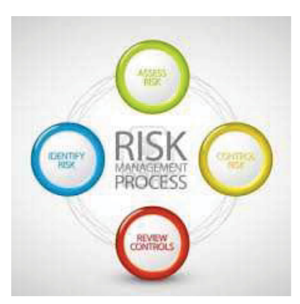
The Risk Management Process 53

The risk management process is an accepted methodology used either implicitly or explicitly in most threat prevention strategies.