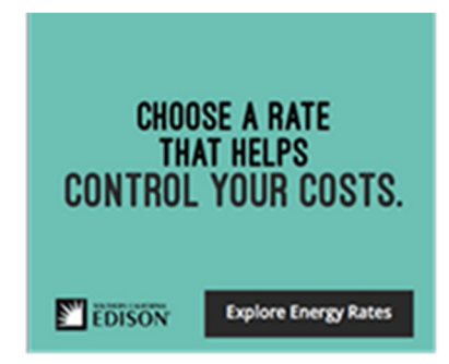
Option 1: Lifestyle