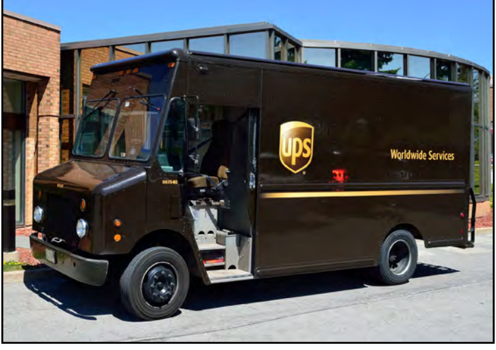
One of San Diego Gas & Electric's proposals is to partner with United Parcel Service to support the electrification of 60 delivery trucks.

in projects that can help stimulate private sector investment and will lead to scaled up [transportation electrification] in various sectors, while balancing costs and ensuring benefits for ratepayers," wrote the judges.