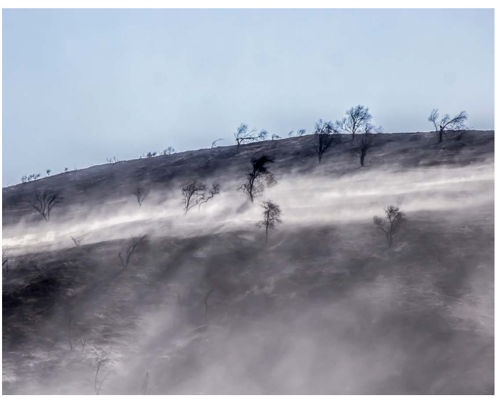
Windstorms blowing ash among blackened trees following the November 2018 Woolsey Fire

But as he and other Commissioners pointed out, the work is ongoing and far from complete. SB 901 requires upgraded plans annually, for one thing. And the CPUC, to ensure that the plans actually reduce the risk and occurrence of catastrophic wildfires, directed