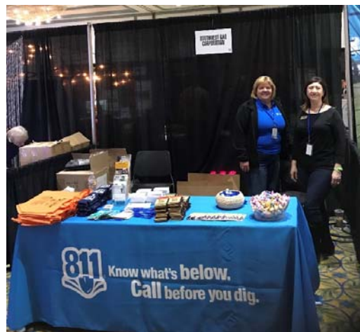
Southwest Gas Program representatives attending the Tahoe Chamber of Commerce Business Expo.