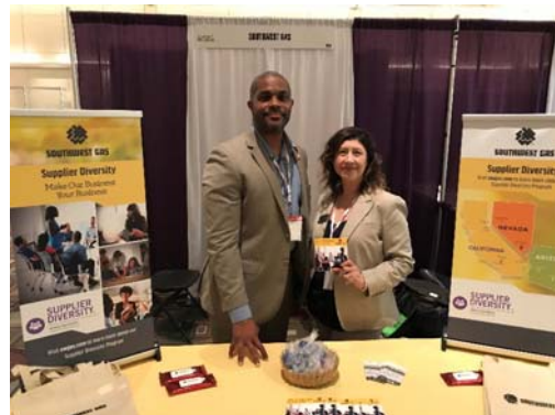
Southwest Gas Supplier Diversity representatives attending Minority Business Opportunity Day.

11/16/18 - American Indian Chamber of Commerce Warrior Event, Anaheim, CA