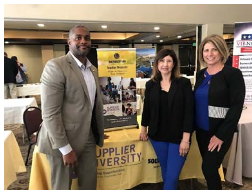
Southwest Gas Program representatives attending the CPUC Small and Diverse Business Expo.