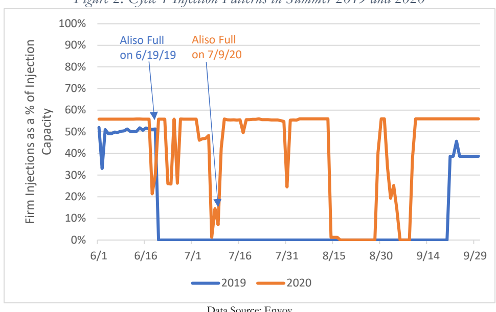
Figure 2: Cycle 1 Injection Patterns in Summer 2019 and 2020