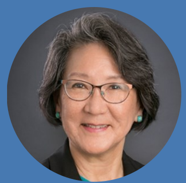
Commissioner Genevieve Shiroma