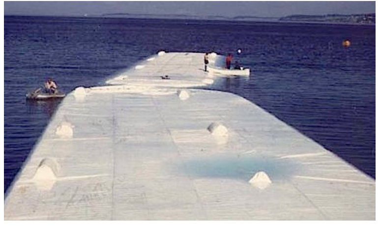
Spraggbags being filled in Port Angeles, WA

The development the Spraggbag by Spragg Associates represents a new approach to moving water. Described in U.S. patent number 5,413,065, it employs elongated flexible fabric barges that can accommodate many acre feet of fresh water, which, because of the density difference with seawater, floats conveniently at the ocean surface. These Spraggbags can be filled, towed either singly or interconnected in long arrays, and then emptied at a destination.