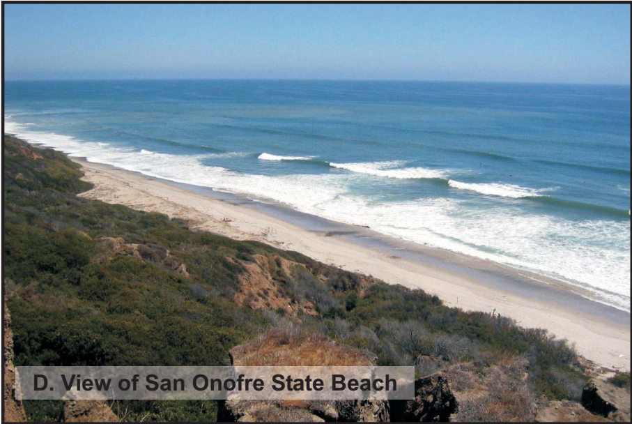
D. View of San Onofre State Beach