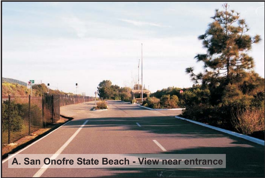
A. San Onofre State Beach - View near entrance