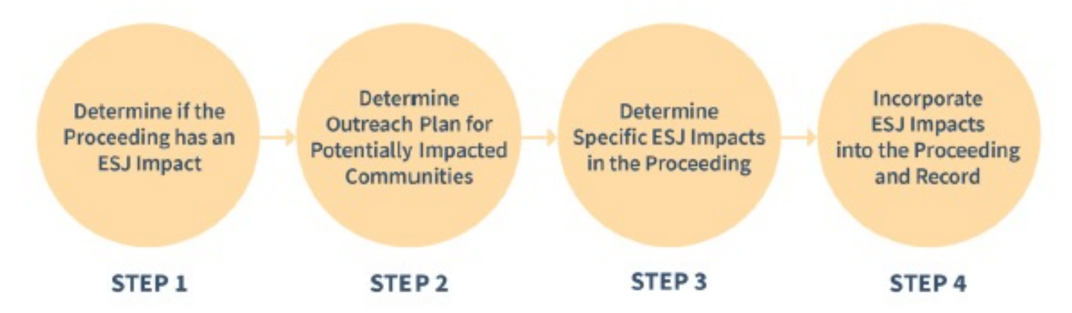
Figure 1: Steps for Incorporating ESJ Considerations into CPUC Proceedings