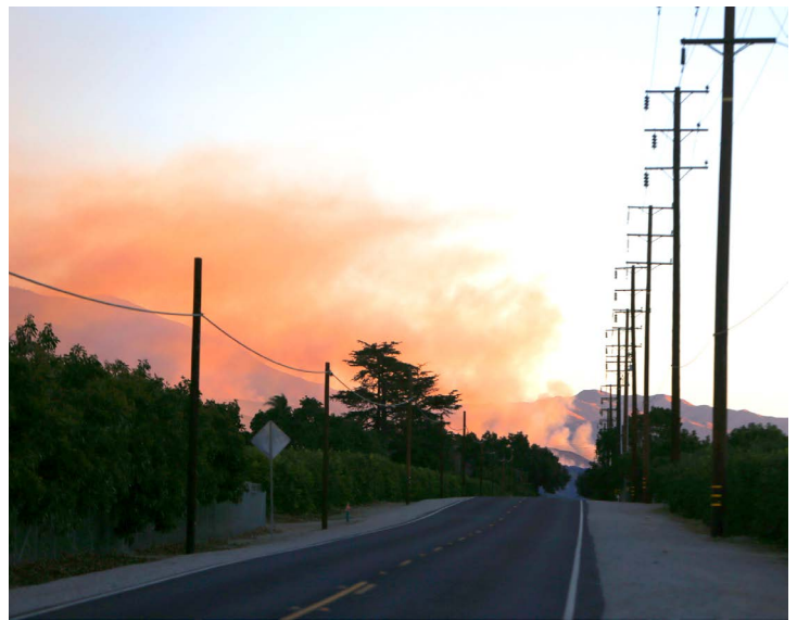
Smoke rises from the Thomas Fire in 2017, approaching power lines and electric infrastructure

"When we are fortunate enough to have forewarning of high-fire